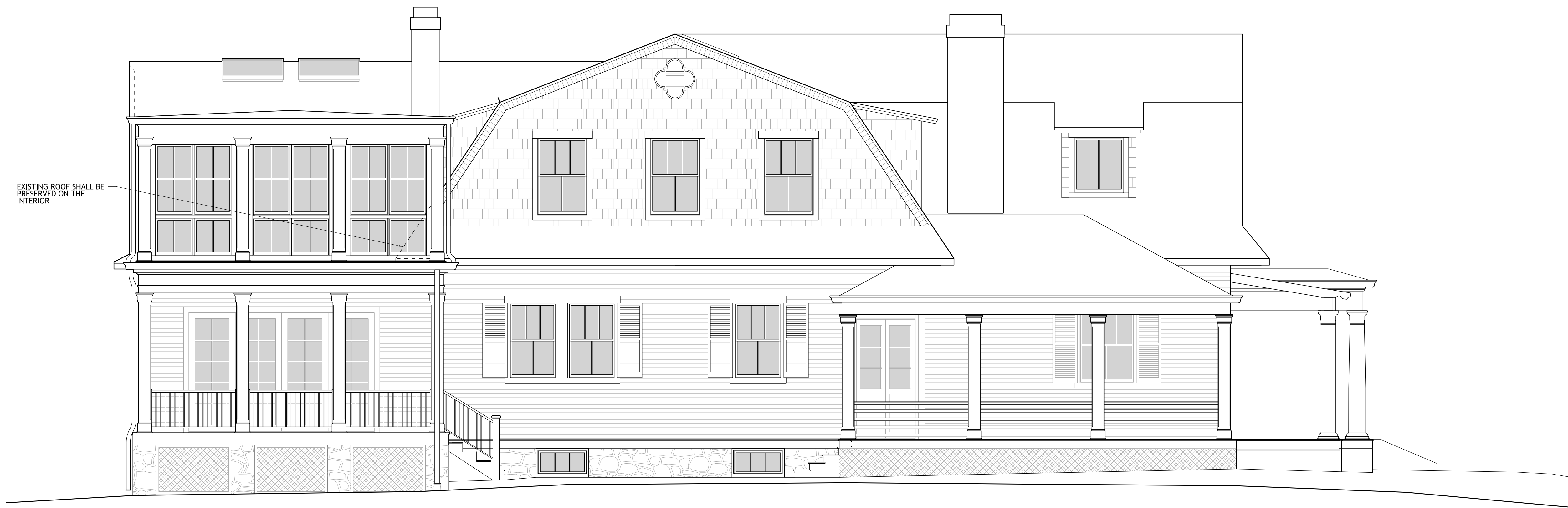
1 A202 PROPOSED WEST ELEVATION SCALE: 1/4" = 1'-0"

EL. +29.53' BLDG. HT. 1'-9 1/2" EL. +27.73' MAX. HEIGHT NEW ROOF 4'-1" EL. +23.63' 2ND FLR. FIN. CLG. 9'-0 1/2" EL. +14.58' 2ND FIN. FLOOR 11'-6" EL. +3.08' 1ST FIN. FLOOR 3'-1" EL. 0.00' AVERAGE GRADE