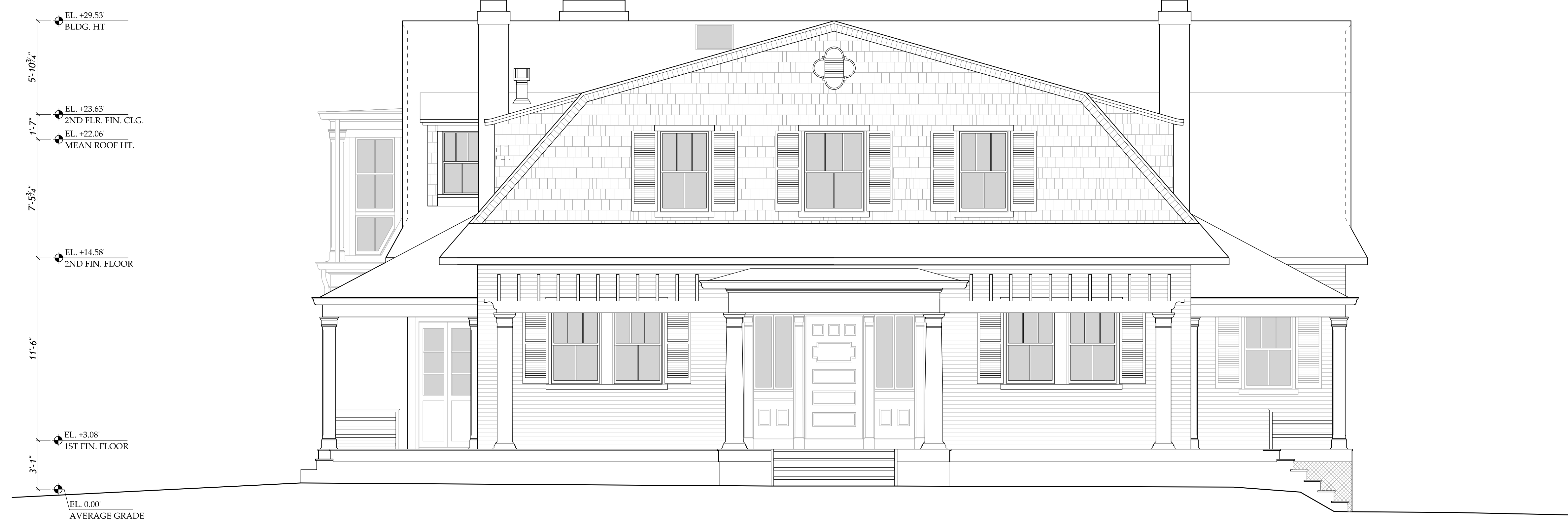
1 A201 PROPOSED SOUTH ELEVATION SCALE: 1/4" = 1'-0"