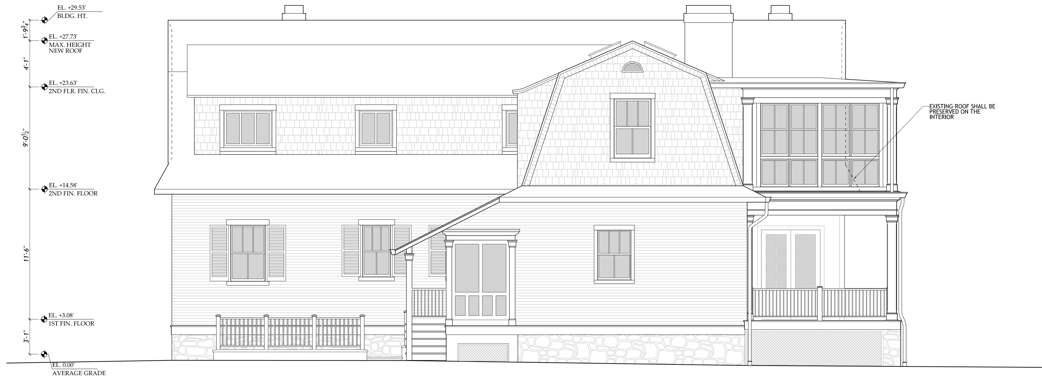
1 PROPOSED NORTH ELEVATION A203 SCALE: 1/4" = 1'-0"