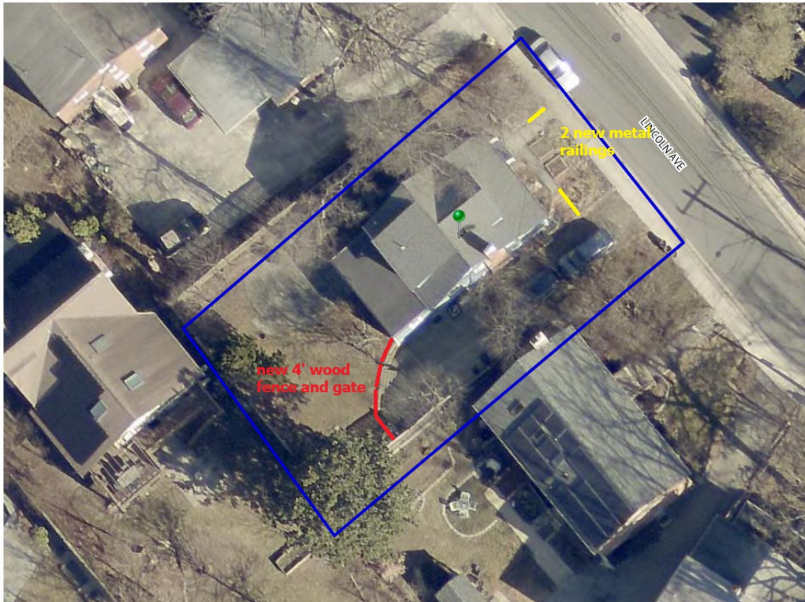
Proposed fence and gate design