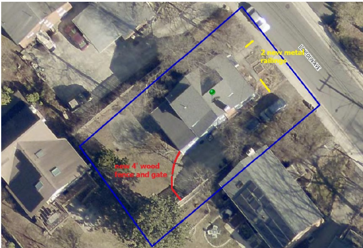
Figure 4: Aerial view of the subject property showing the locations of work.