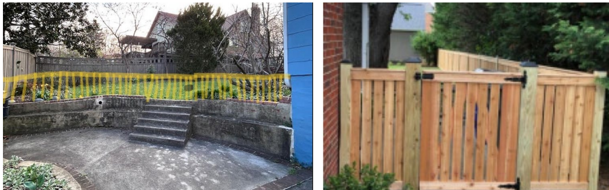
Figure 2: Location of the proposed fencing along the top of the retaining wall (left) and example of the proposed fence and gate (right). The gate would be located at the top of the concrete stairs leading from the sunken patio to the rear yard.

The applicant proposes to install 4-foot tall cedar board fencing along a retaining wall above a sunken patio in the side rear yard of the property and to install simple metal handrails along two sets of steps leading to the front walkway.