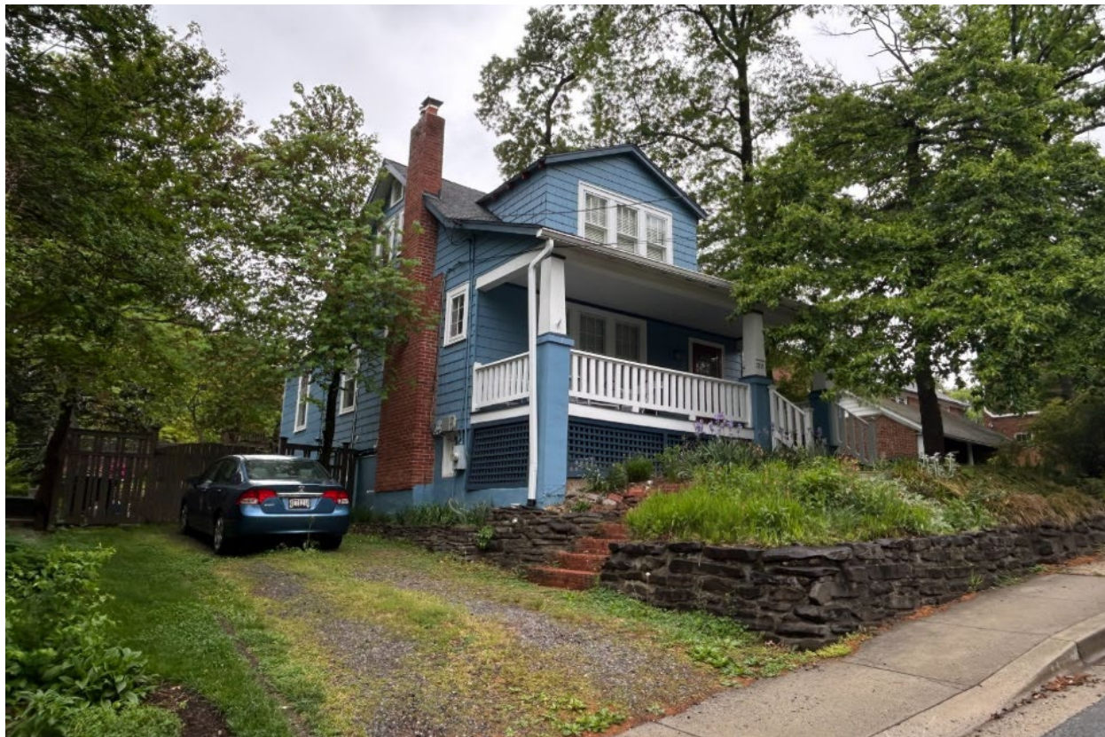
Figure 5: View of the subject property from Lincoln Avenue. The proposed fencing would be located behind the existing fencing beyond the driveway on the far left.

Staff also finds that these elements could be removed in the future without impairing the integrity or form of the property, per Standard 10 .