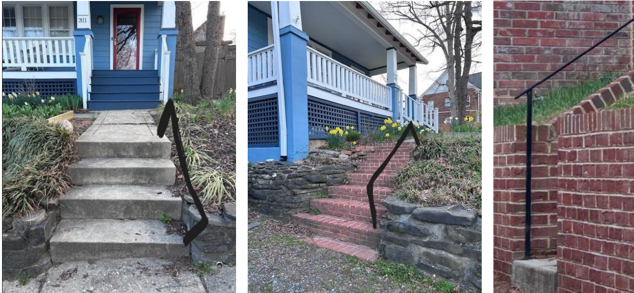
Figure 3: Mock-up of the railing location along the front steps (left); mock-up of the railing location along the side steps (center); and example of the proposed metal railing (right).