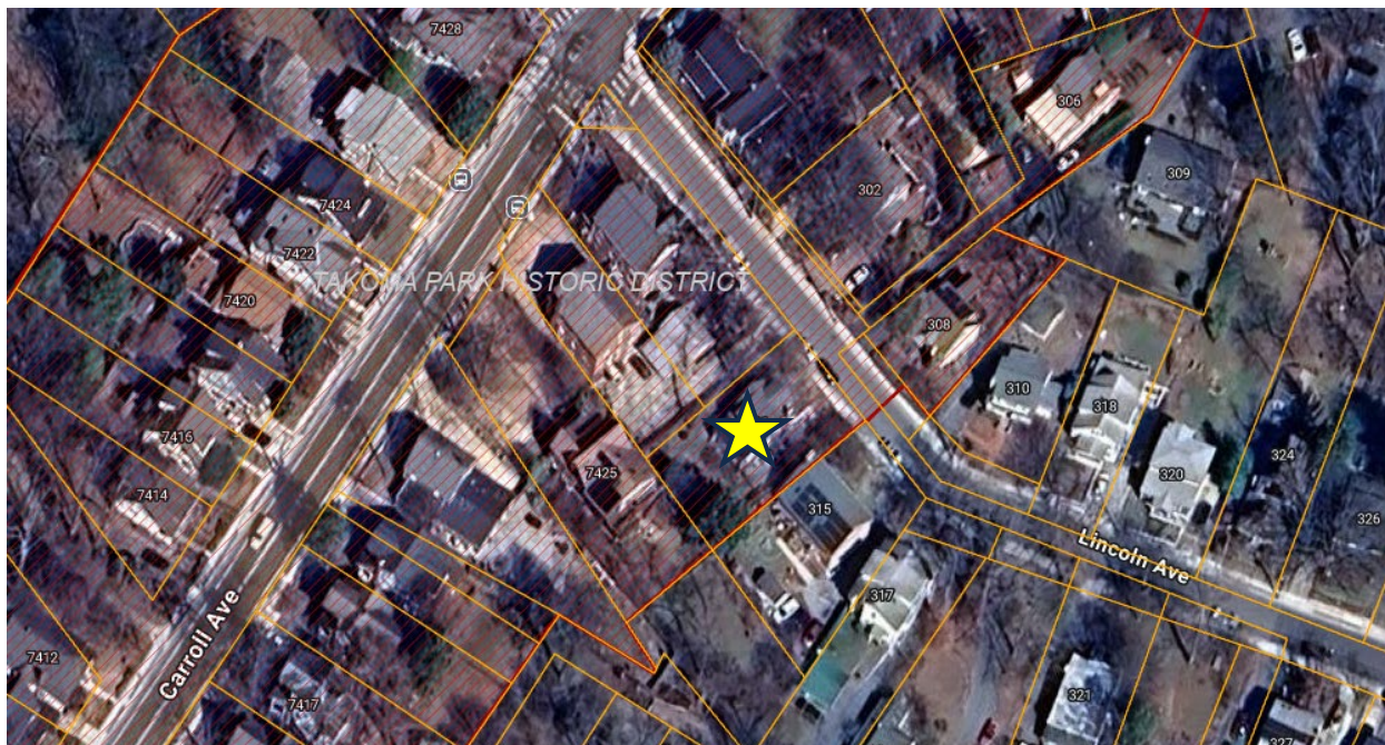
Figure 1: The location of the subject property (shown with a yellow star) in the Takoma Park Historic District.