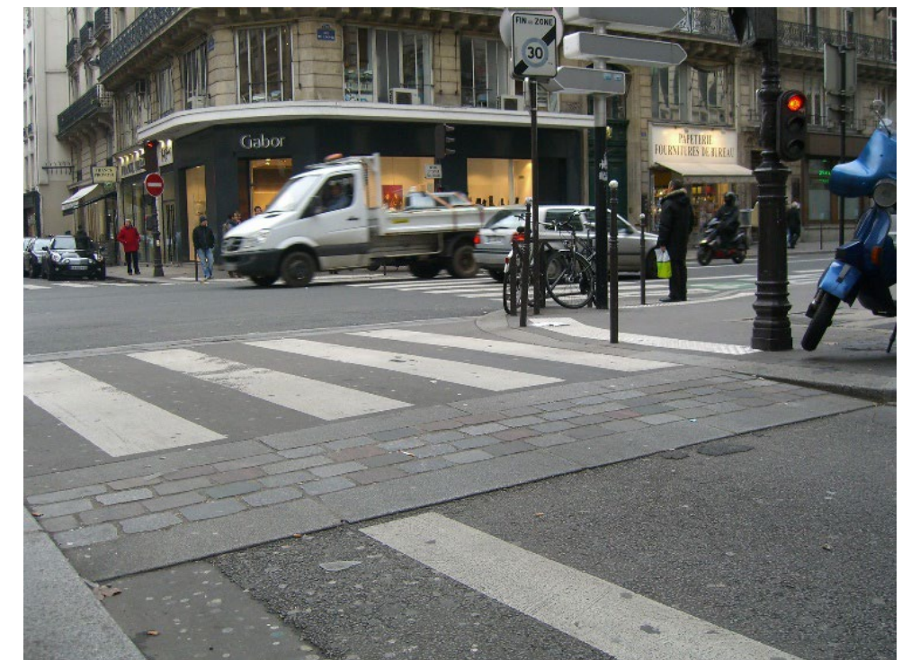
A raised crossing at sidewalk-level across a low-speed, low-volume street.

B-3d: Provide marked crosswalks and Accessible Pedestrian Signals (APS) at all legs of an intersection where there are connecting sidewalks or comfortable streets.