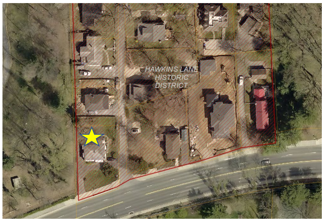
Figure 1: 4201 Jones Bridge Rd. is at the corner of Hawkins Lane and Jones Bridge Rd.