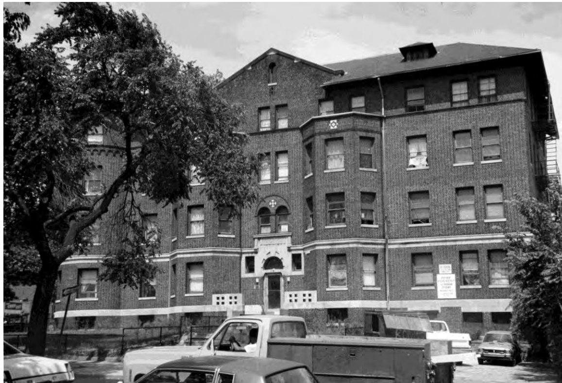
Augusta Apartments (1900)