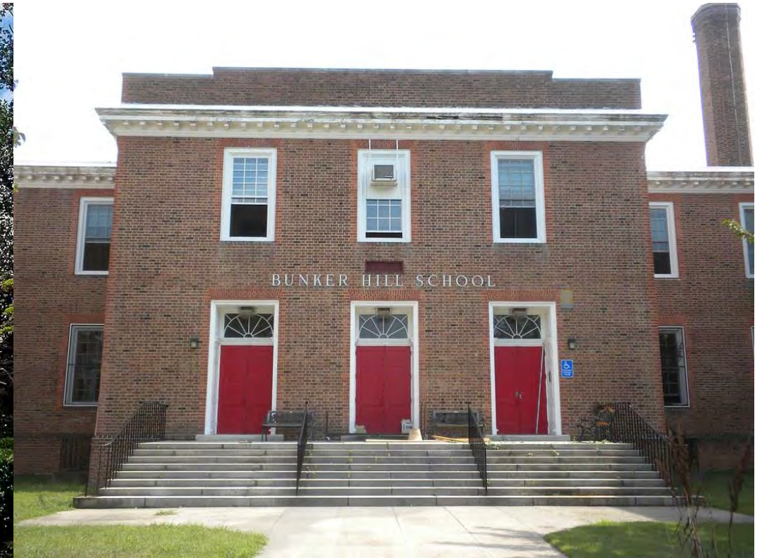
Bunker Hill Elementary School (1939-1953)