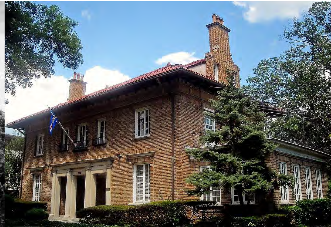
Babcock-Macomb House (1912)