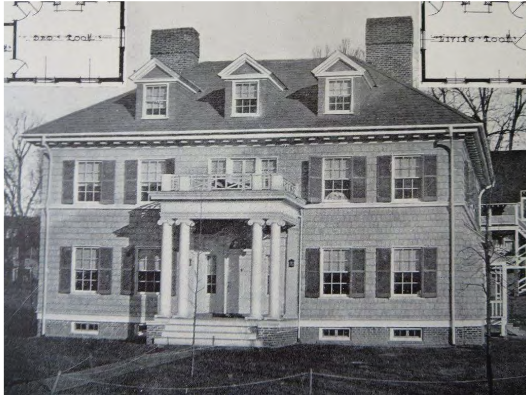
17 Primrose Street as featured in American Architect , 1911.