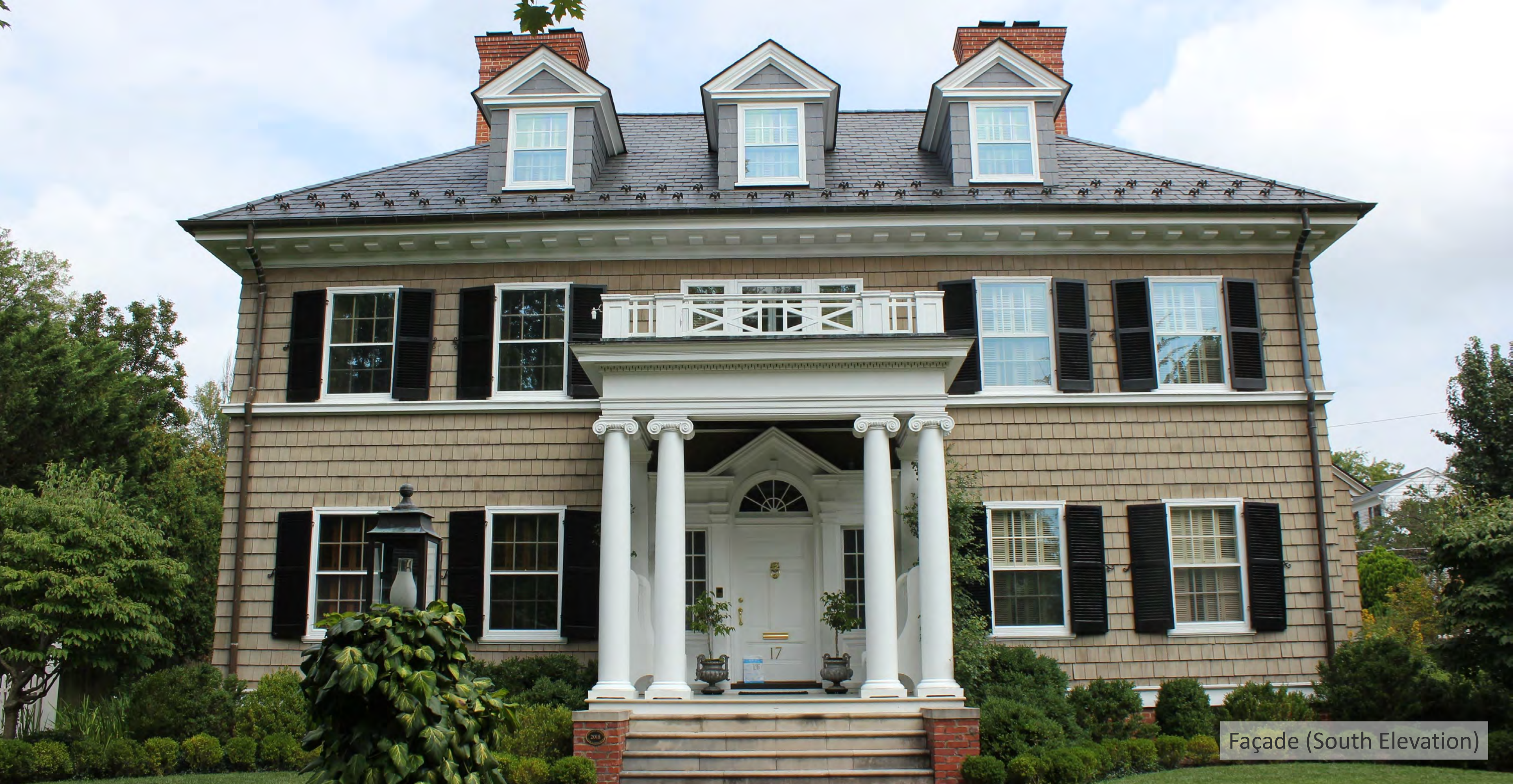
Façade (South Elevation)