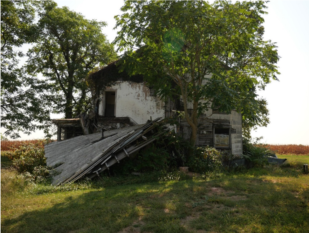
Figure 4: View of the west elevation.