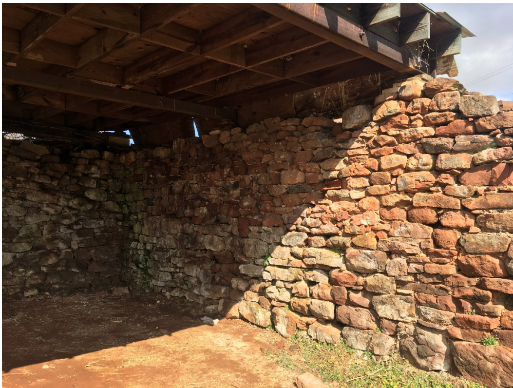
Figure 10: Bank barn foundation.