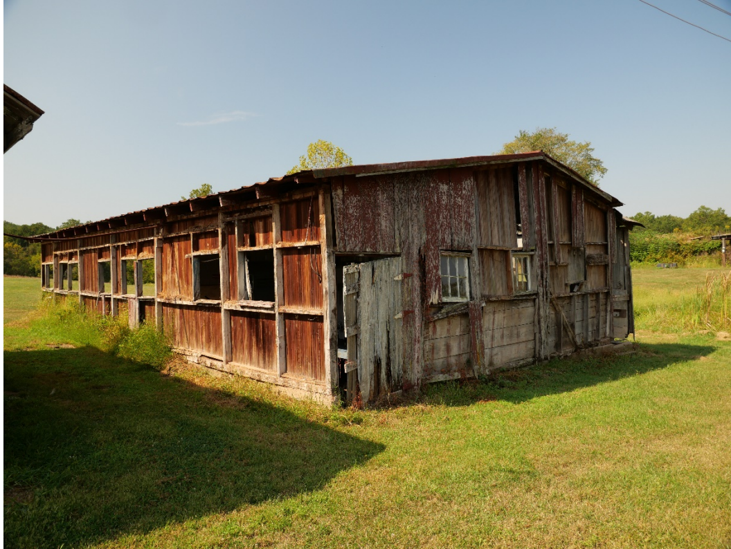
Figure 9: Dairy barn, c. 1920s – 1930s.