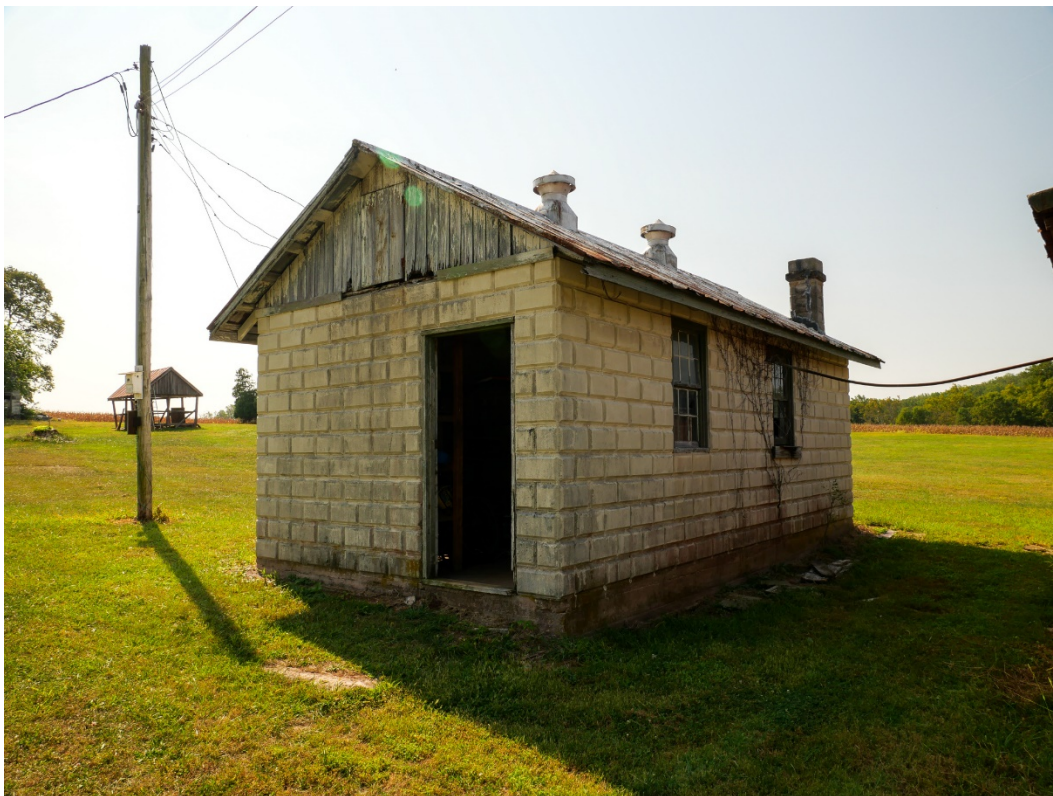
Figure 8: Milk House, c. 1920s-1930s.