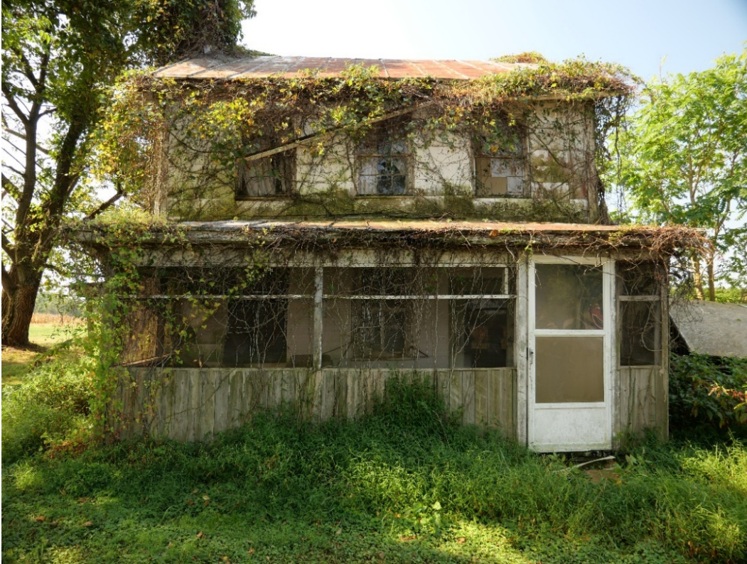
Figure 3: View of the façade (north elevation)