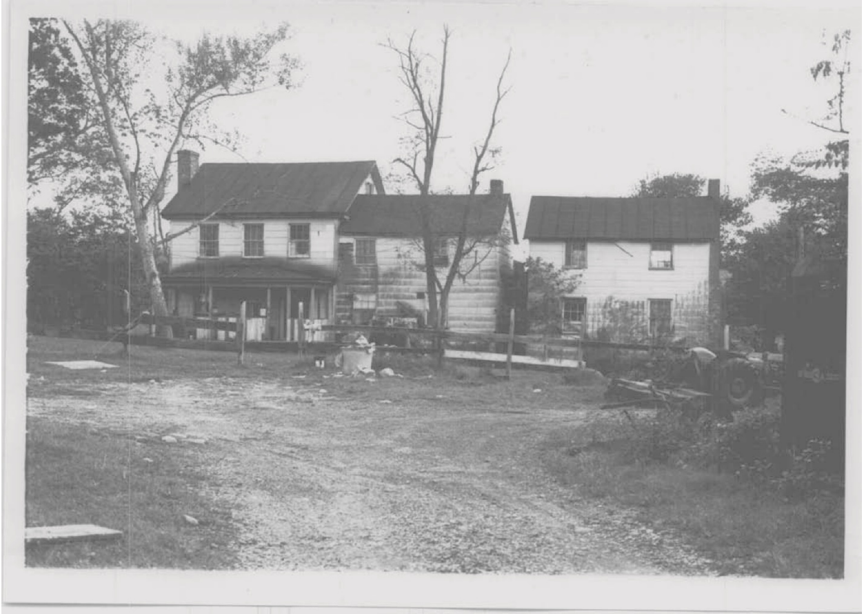
Figure 1: 1973 Survey Photo of the Thomas H. White House.