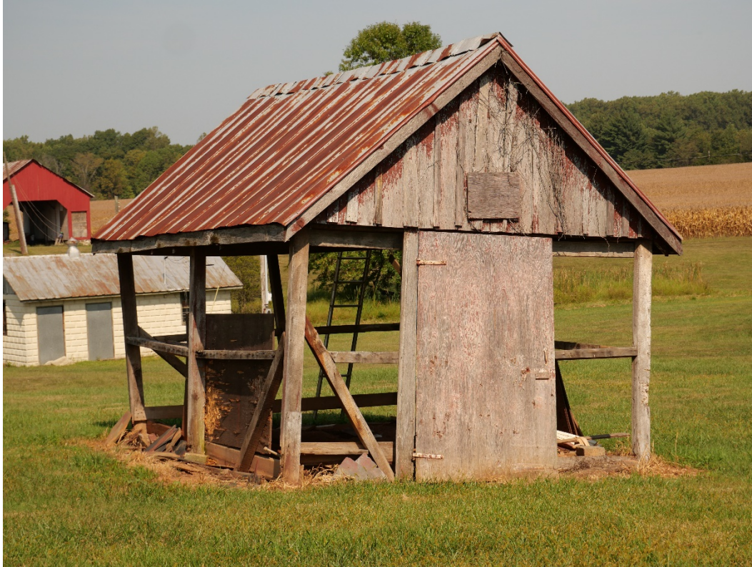
Figure 7: Outbuilding to the west of the Thomas H. White House.