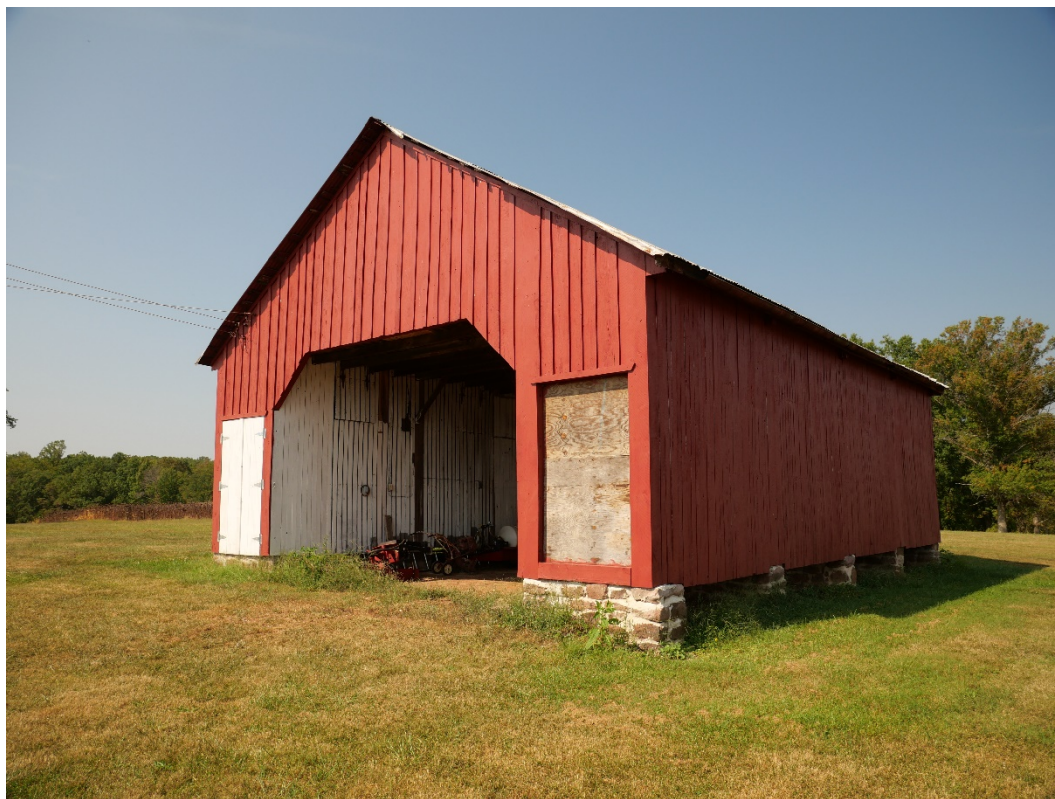
Figure 11: Corn crib.