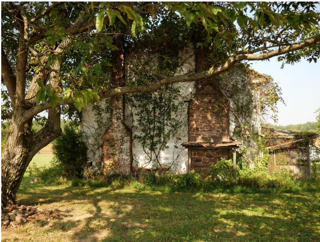
Figure 6: View of the east elevation.