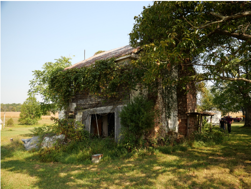
Figure 2: View of the south and east elevations.