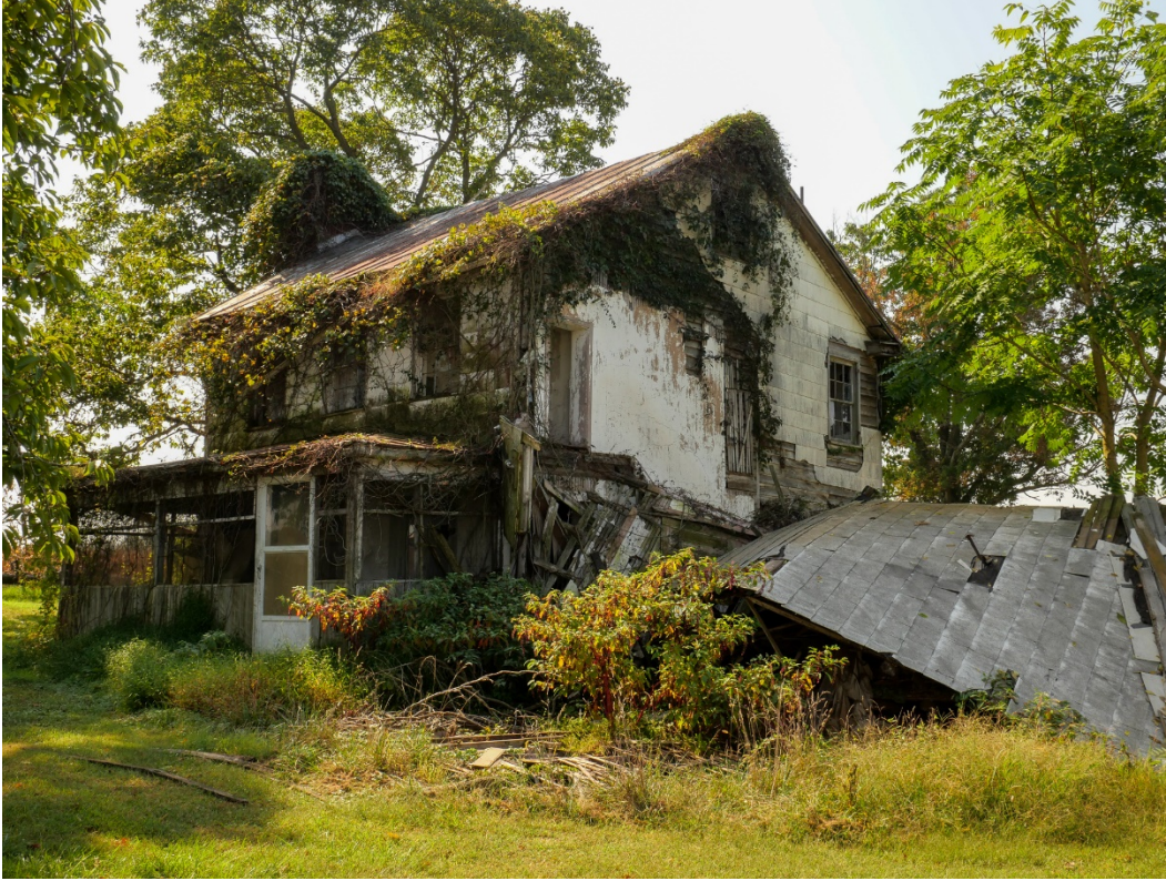
Figure 1: View of the façade (north) and west elevation.