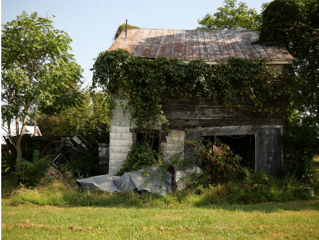
Figure 5: View of the south elevation.