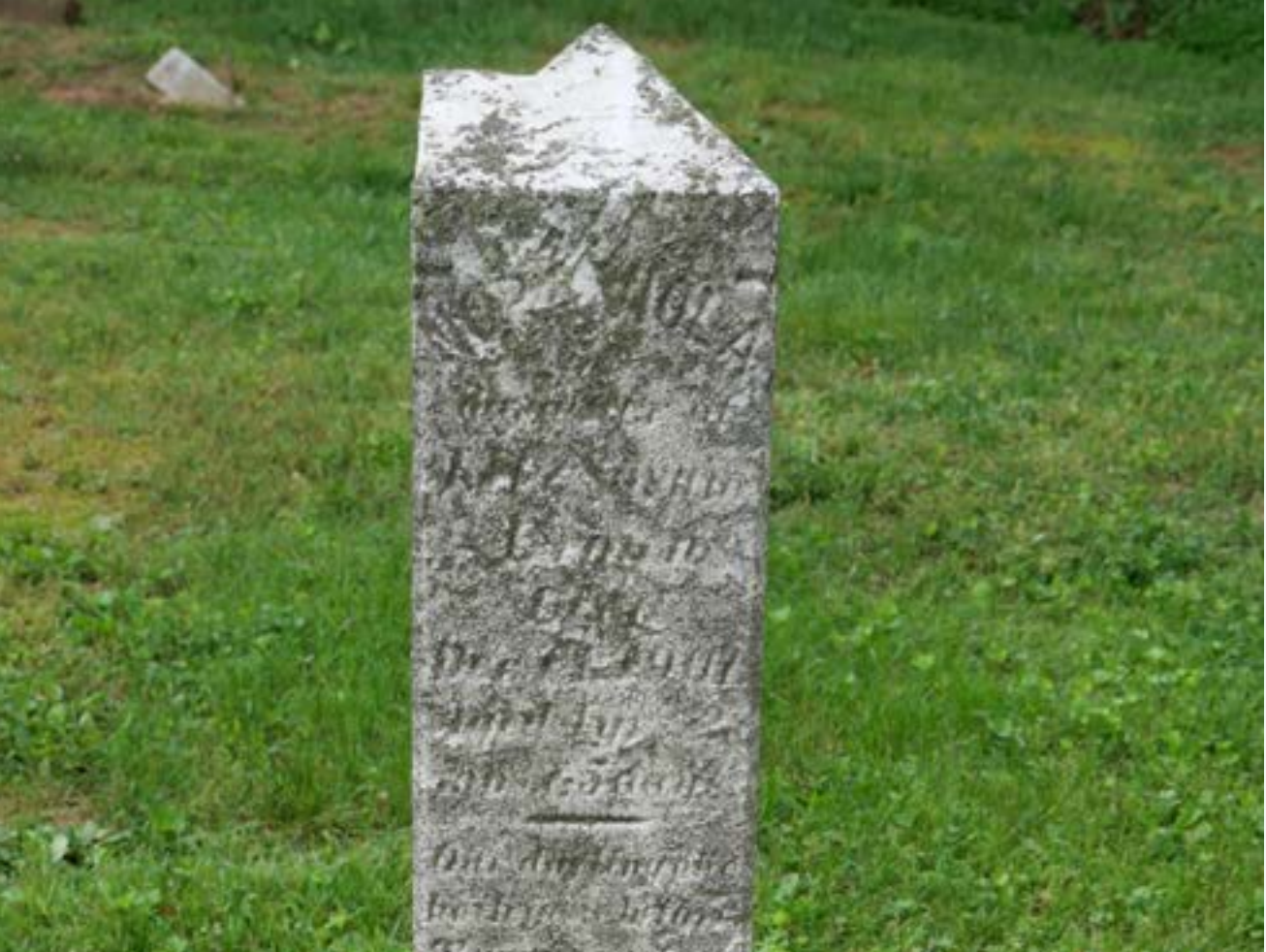
Standards for Maintenance of Burial Sites