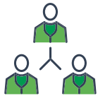
Development Review Committee

Cemetery Requirements: Stake cemetery boundary, include boundary on preliminary plans