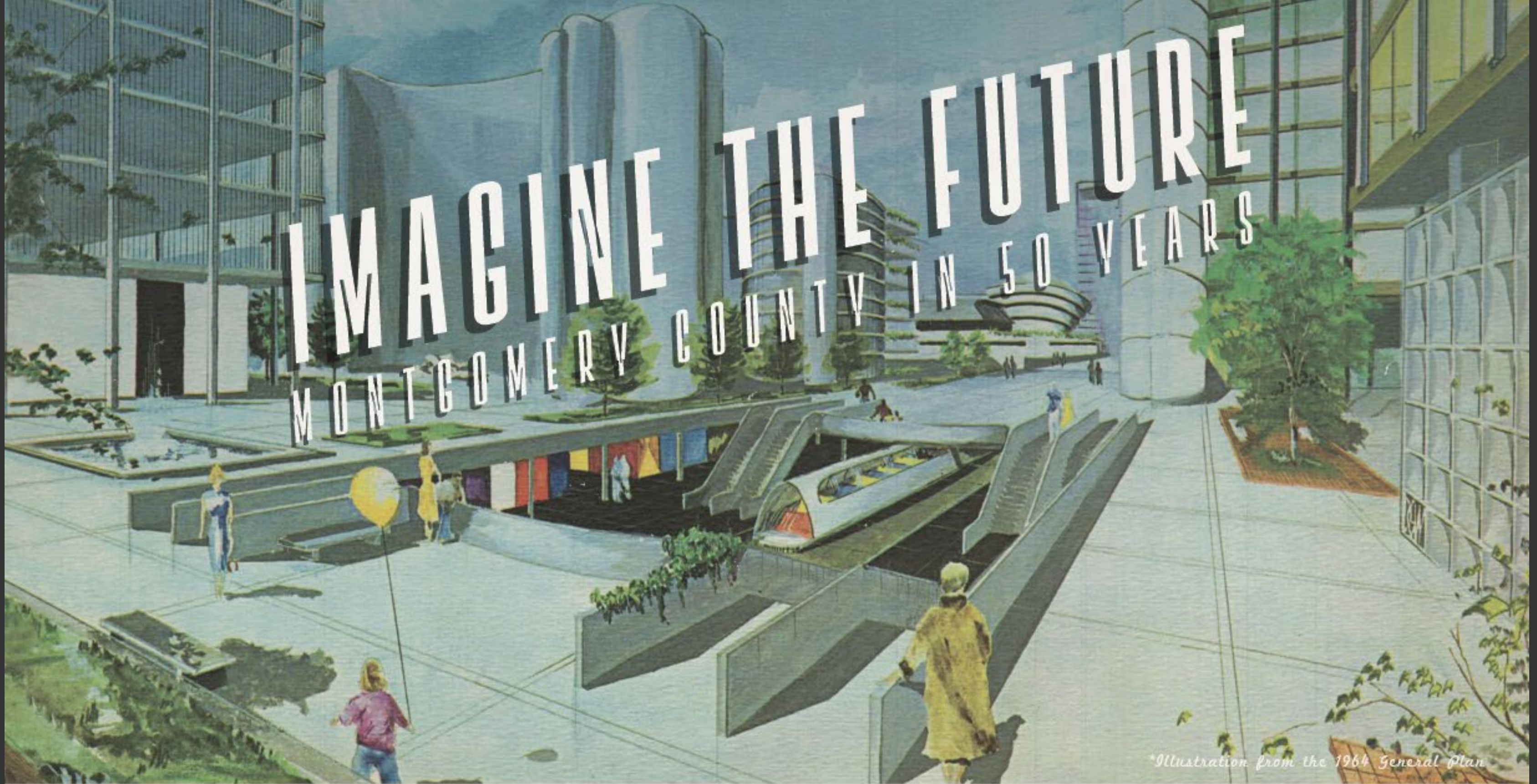
*Illustration from the 1964 General Plan