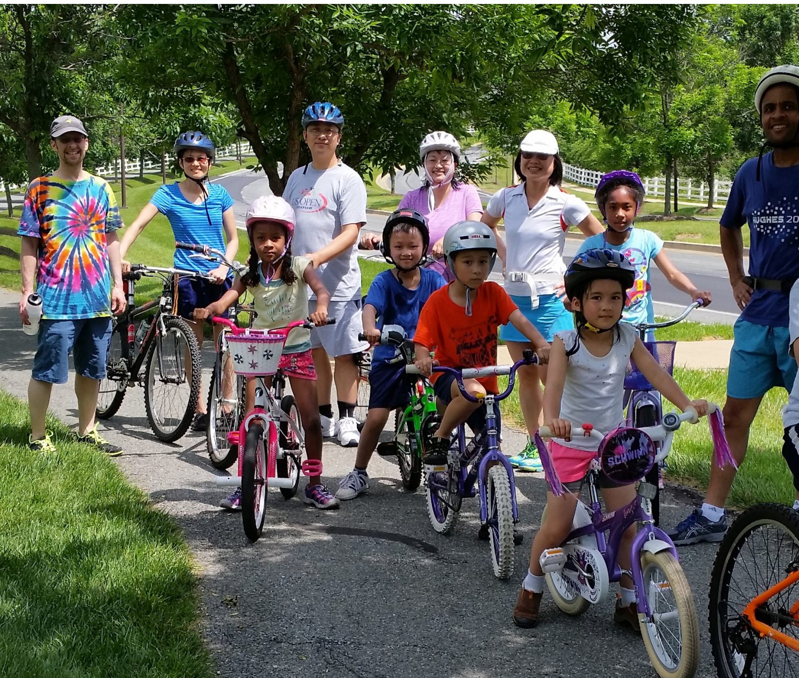
Community residents participate in a group bike ride.