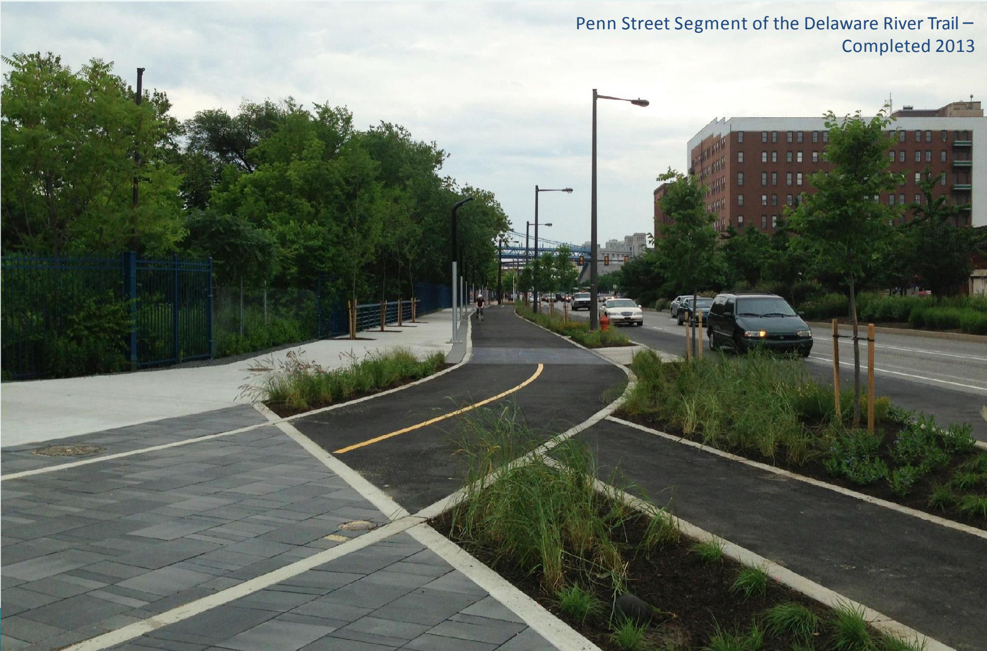
Penn Street Segment of the Delaware River Trail – Completed 2013