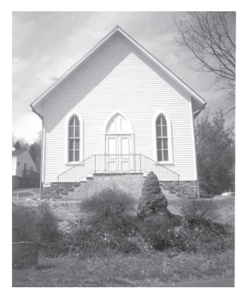
This Hyattstown restoration project, shown before (top) and after, qualified for a County preservation tax credit.