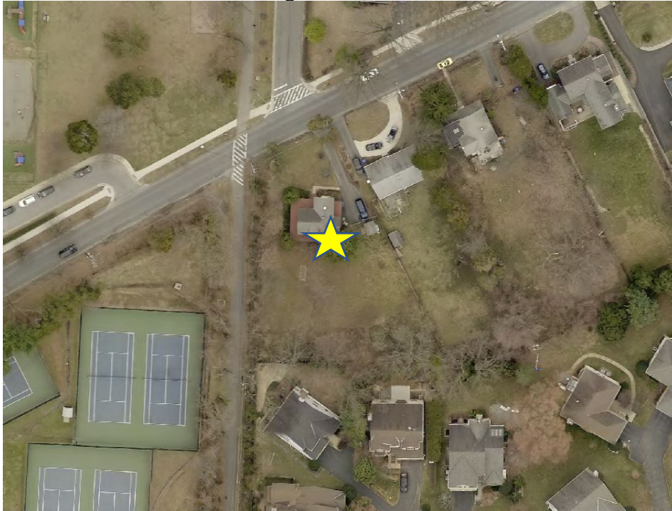
Figure 1: Alta Vista is located at the intersection of Beech Ave. and Montgomery Ave.

SIGNIFICANCE: Individually Listed Master Plan Site ( Alta Vista 35/03 ) STYLE: Queen Anne DATE: c.1850 w/ significant alterations c.1880