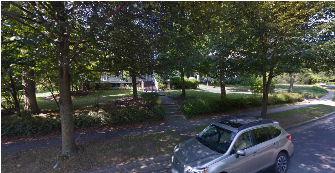
Figure 2: Streetview image from July 2017 before the trees were removed.

The applicant removed two 12” (twelve inch) d.b.h. Holly trees from either side of the front walk and a 16” (fourteen inch) d.b.h. Gingko tree, which the applicant identifies as dead at the time of its removal. The three trees can be seen in the Google Streetview image below, taken in July, 2017.