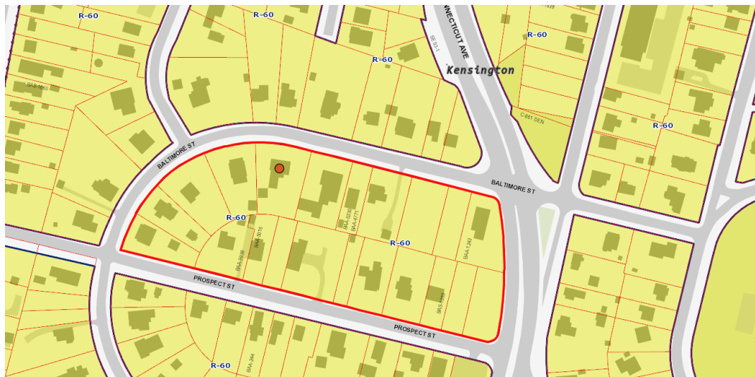
Figure 1: 3928 Baltimore St. is identified with a red dot.

SIGNIFICANCE: Outstanding (Primary One) Resource to the Kensington Historic District STYLE: Colonial Revival DATE: c. 1880-1910