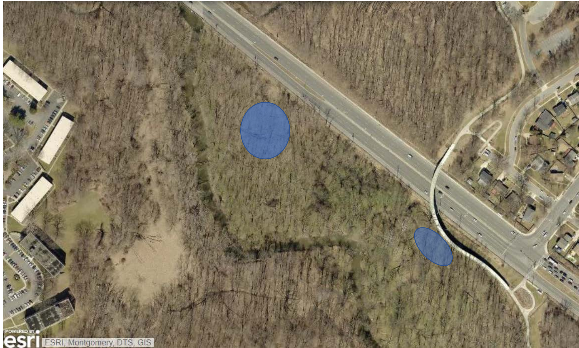
Areas tested by soil test pits and potential locations for mill structure 2015 aerial, http://gis3.montgomerycountymd.gov/historical_images/