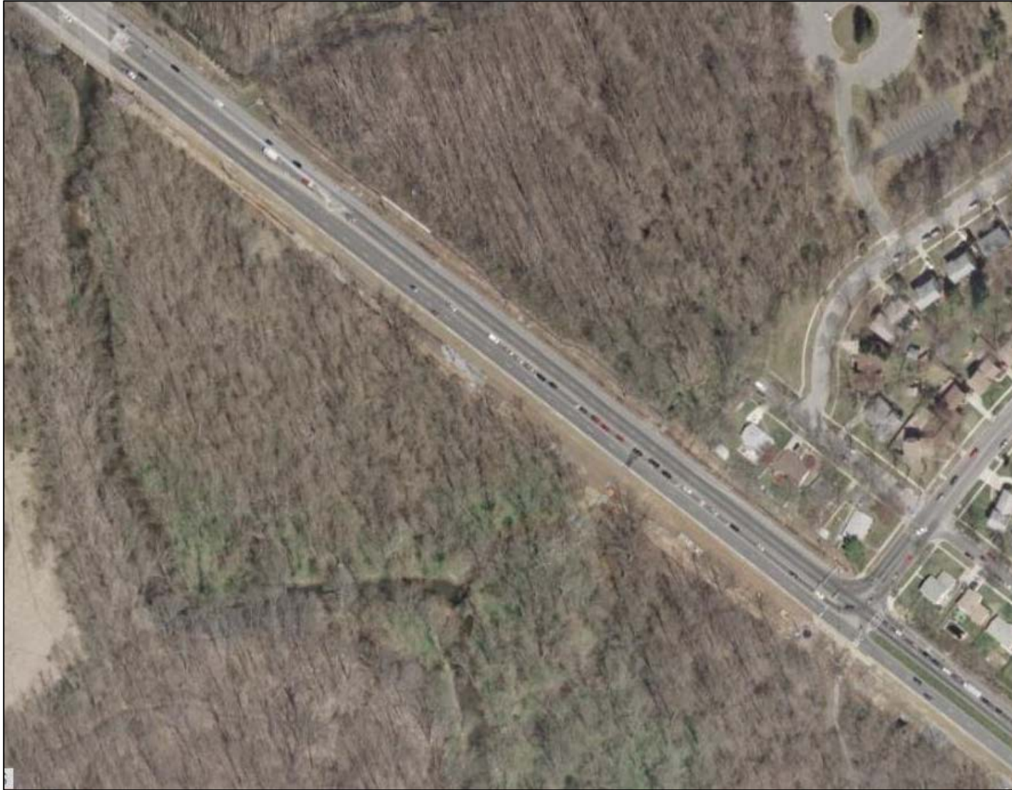
2004 aerial showing construction activity along south side of Veirs Mill Road (MD 586) http://gis3.montgomerycountymd.gov/historical_images/