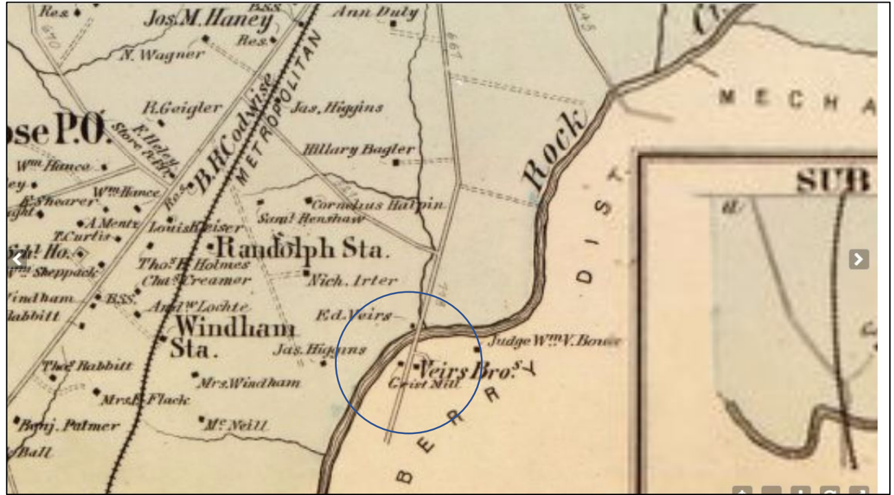
1878 GM Hopkins Atlas of Fifteen Miles Around Washington, including the County of Montgomery, Maryland.