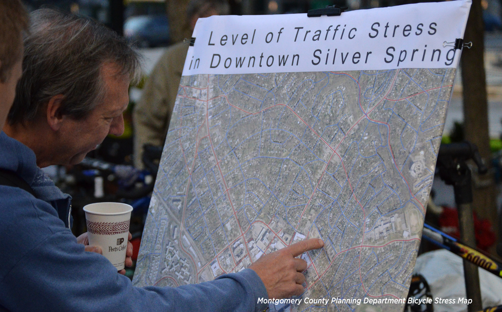
Montgomery County Planning Department Bicycle Stress Map