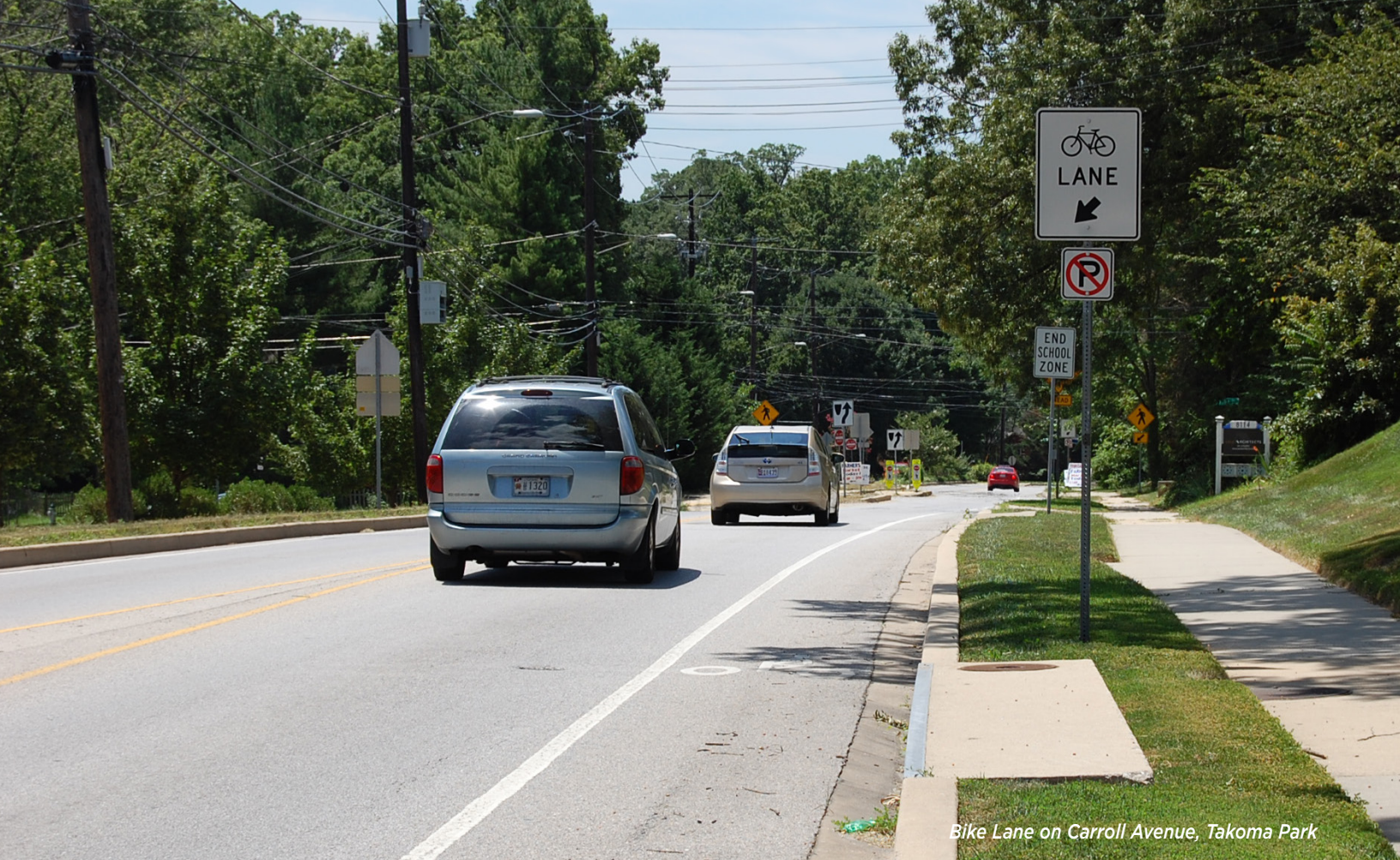
Bike Lane on Carroll Avenue, Takoma Park