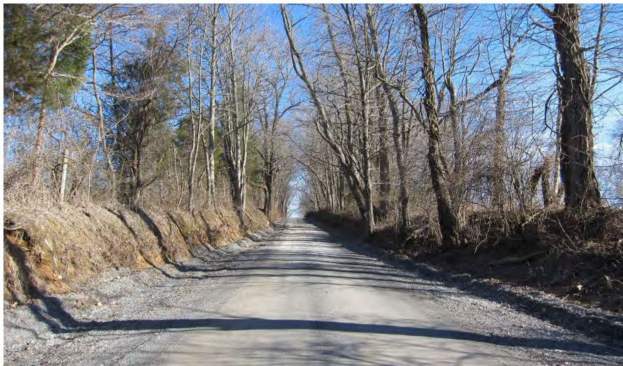
Grading on West Harris Road, exceptional rustic, has widened the road and cut into the banks along the roadside, resulting in extensive erosion and ongoing tree loss.