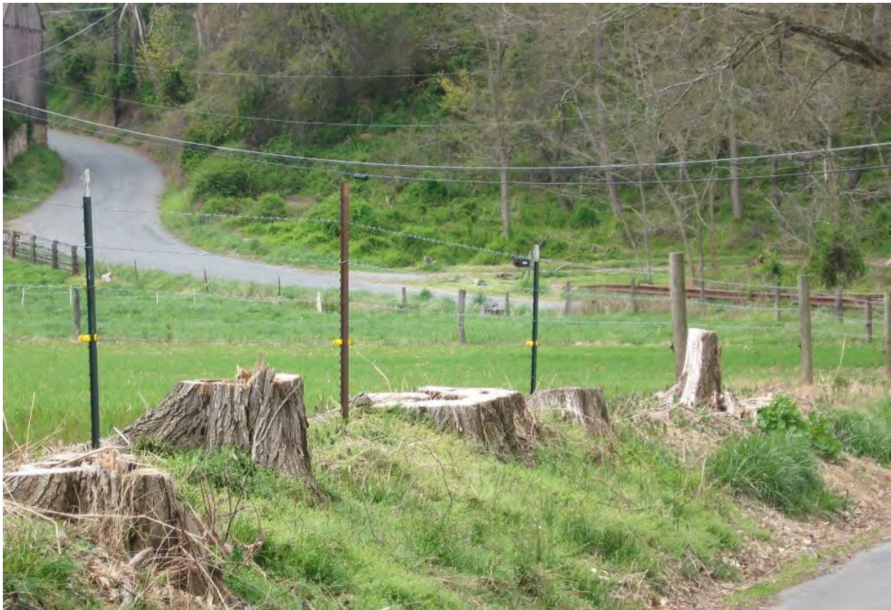
The trees lining Gregg Road, a rustic road, were a Significant Feature

Trees and hedgerows, including some listed as Significant Features of the roads, have been lost or removed. The majority of the removals have been by individuals or by utility companies. The committee attempted to work with a local utility provider, as provided in County Code, but later found that tree removals proceeded without consultation.