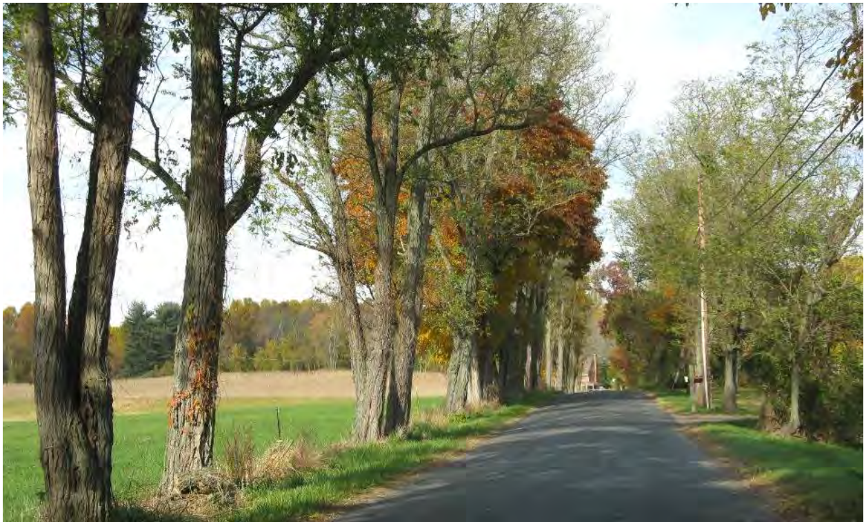
Gregg Road, rustic

Time has shown the prescience of the Montgomery County Council's action in creating the Rustic Roads Program. Preserving the rustic roads has safeguarded the Montgomery County Agricultural Reserve, our farms and our working landscapes, while also celebrating our historic landscapes such as the C&O Canal, and our rural hamlets and villages such as Sandy Spring, Boyds, Barnesville and Hyattstown. The appreciation of our history and local heritage has grown since the program was created, and our local farming has been shifting to include the production of more table crops and farms for the public to visit such as Pick Your Own orchards, vineyards with tasting rooms and agritourism destinations.