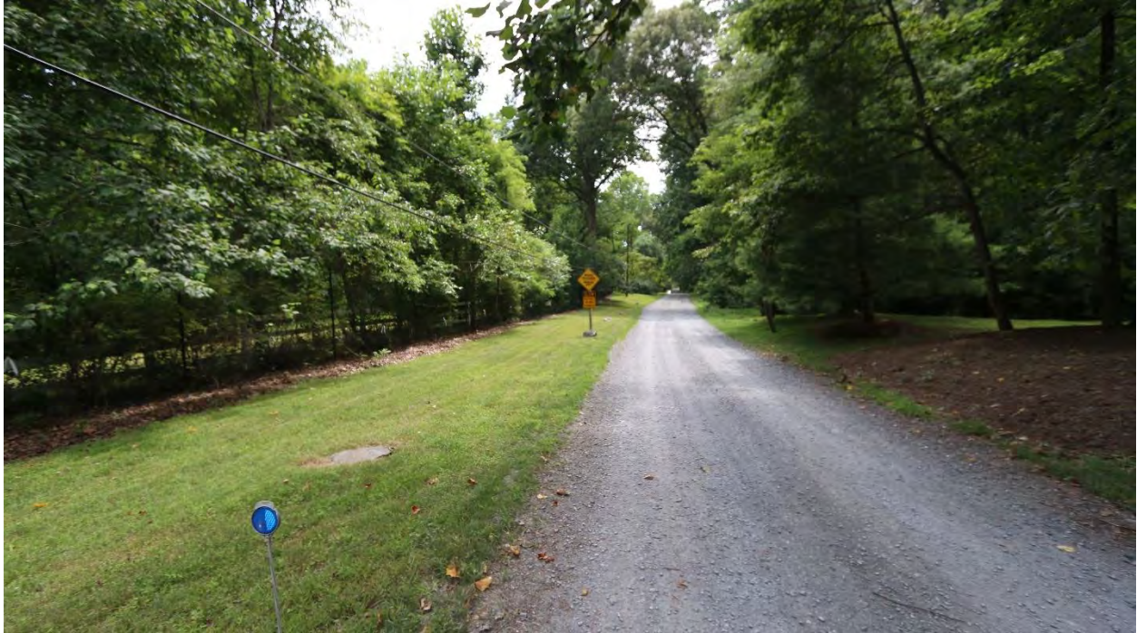
Poplar Hill Road, rustic

Residents of Poplar Hill Road and the committee have received a letter from MCDOT, accepting responsibility for maintenance of the road, but an engineering study that was performed shortly thereafter continues to state that the road is Dedicated But Unmaintained. This status appears to contradict MCDOT's letter. This issue needs to be clarified for all three roads.