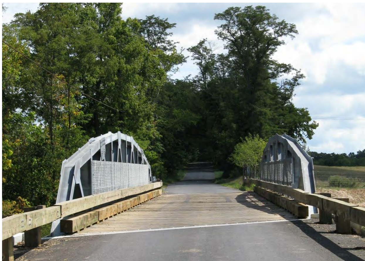
Replacement bridge, Mouth of Monocacy Road, exceptional rustic