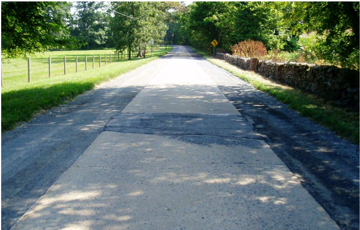
Martinsburg Road, exceptional rustic, designated in the Master Plan for Historic Preservation