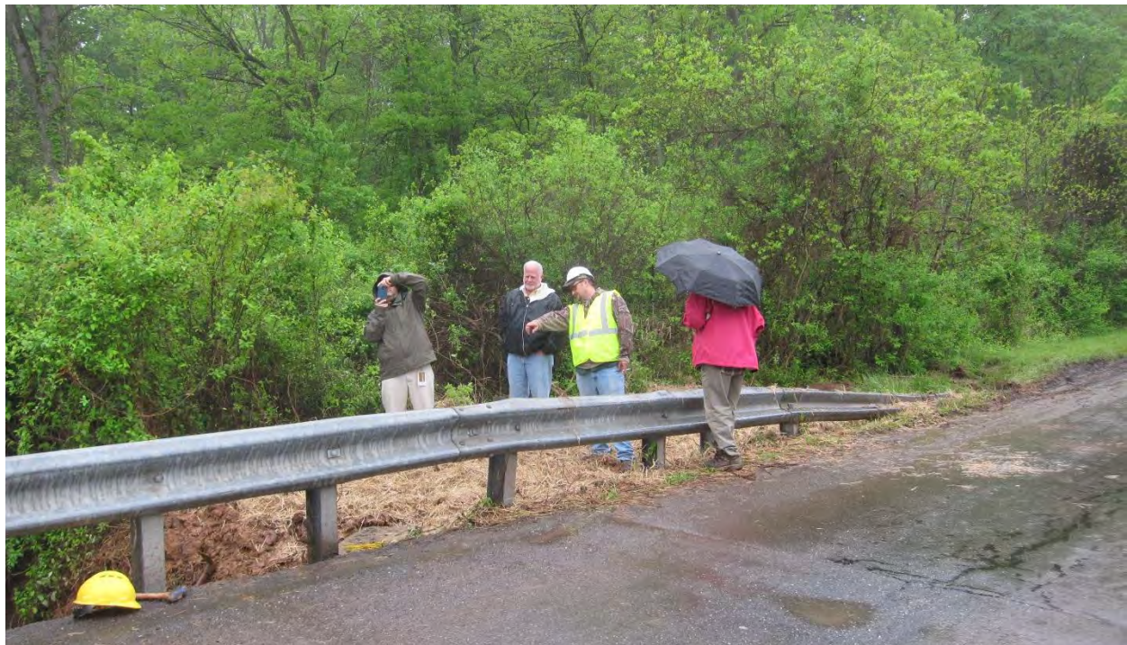
Workers discuss a culvert replacement project with committee members Sugarland Road, exceptional rustic

Full support for the program will be evident when the needed time and resources are directed to the program, and staff is rewarded for supporting the program and its goals.