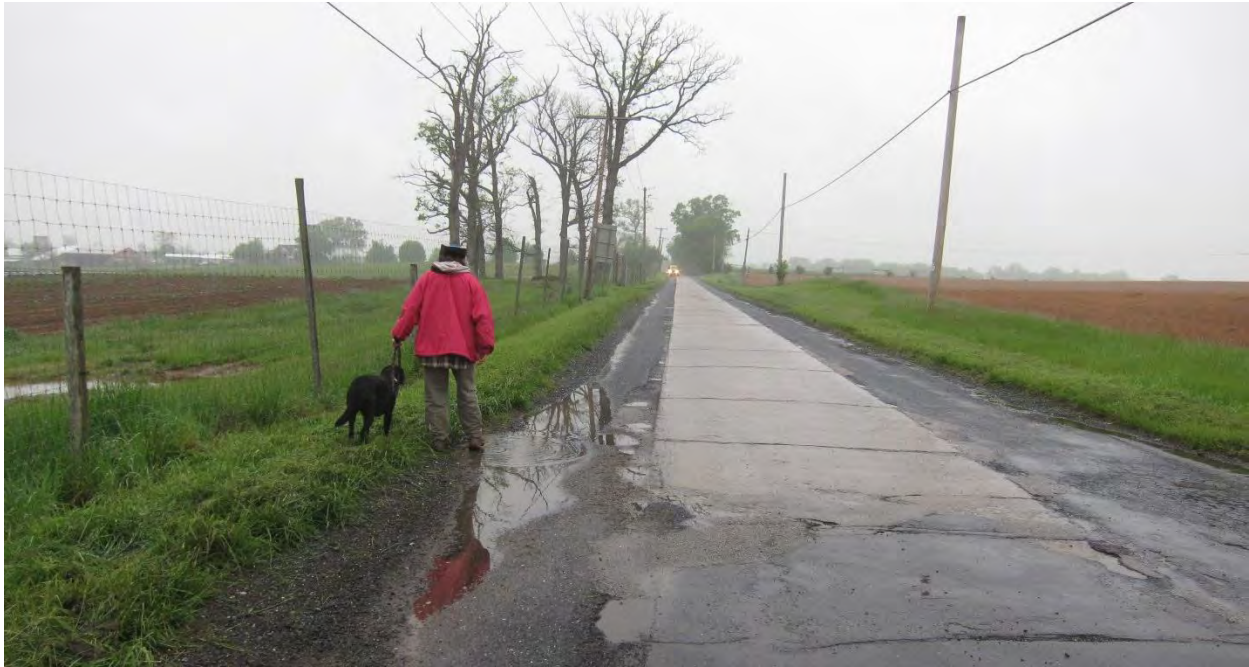
Poor results of shoulder work, Sugarland Road, exceptional rustic

Rustic roads are unique. If the roads are to be preserved, maintenance techniques must reflect the individual needs of the individual roads. The committee would like to work with MCDOT to find solutions to this long-standing problem.