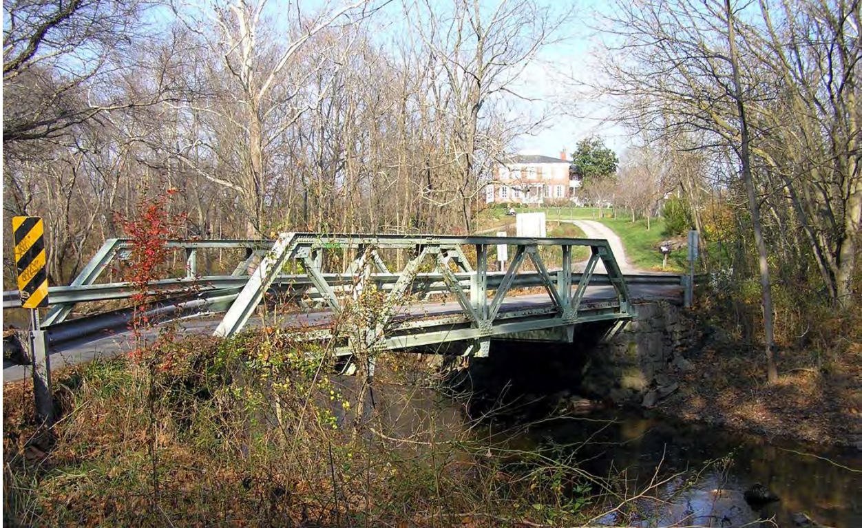
Montevideo Road, exceptional rustic

Another positive event was the restoration of the Seneca sandstone abutments on the 1910 truss bridge on Montevideo Road , following major storm damage in September 2011. MCDOT reinforced the abutments from behind to retain the stone facing. This iconic bridge played an important role in the creation of the Rustic Roads Program when it was proposed for replacement in the 1980s.