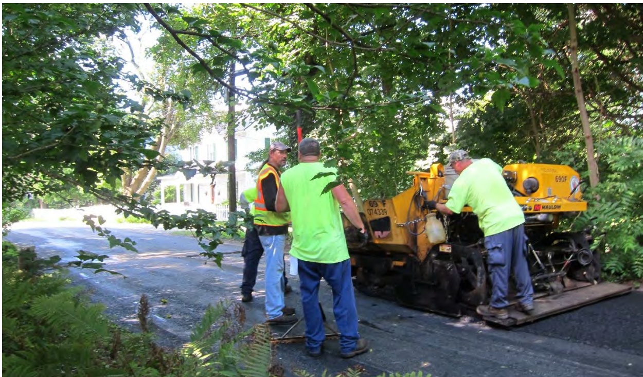
MCDOT staff works on White Ground Road, exceptional rustic