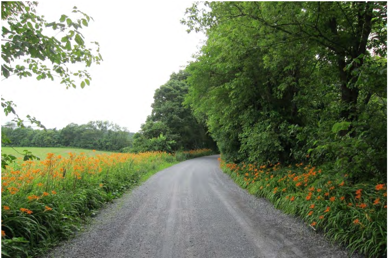
West Harris Road, exceptional rustic

STATUS AND REFLECTIONS ON THE MONTGOMERY COUNTY RUSTIC ROADS PROGRAM, 1996 – 2016 March 2017