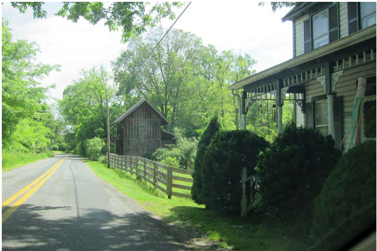
Big Woods Road, rustic

Many challenges remain. Increasing development and traffic pressure, especially from neighboring jurisdictions; the increasingly residential rather than rural nature of some rustic roads, particularly outside the Agricultural Reserve; and the constraints of maintenance budgets will continue into the foreseeable future. Access for large farm equipment will continue to be an issue with overhanging foliage and new roadside barriers.