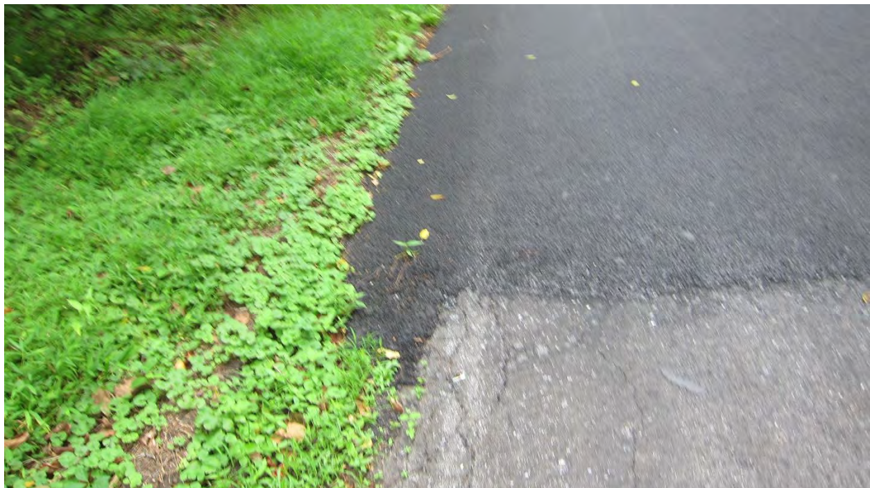
Close up of how repaving widens roads – White Ground Road, exceptional rustic

Widening of rustic roads, most often through routine maintenance practices, is another negative change. Widening strongly impacts the character of the rustic roads, including changing the edges of the roadways, and influences driver behavior, encouraging speeds to increase. Spot checks of road widenings by the committee suggest that this issue is pervasive: