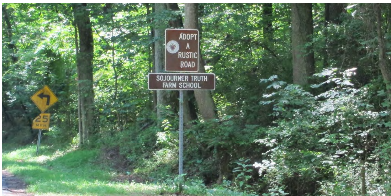
Martinsburg Road, exceptional rustic

From the Status of the Rustic Roads Program, 2008-2010