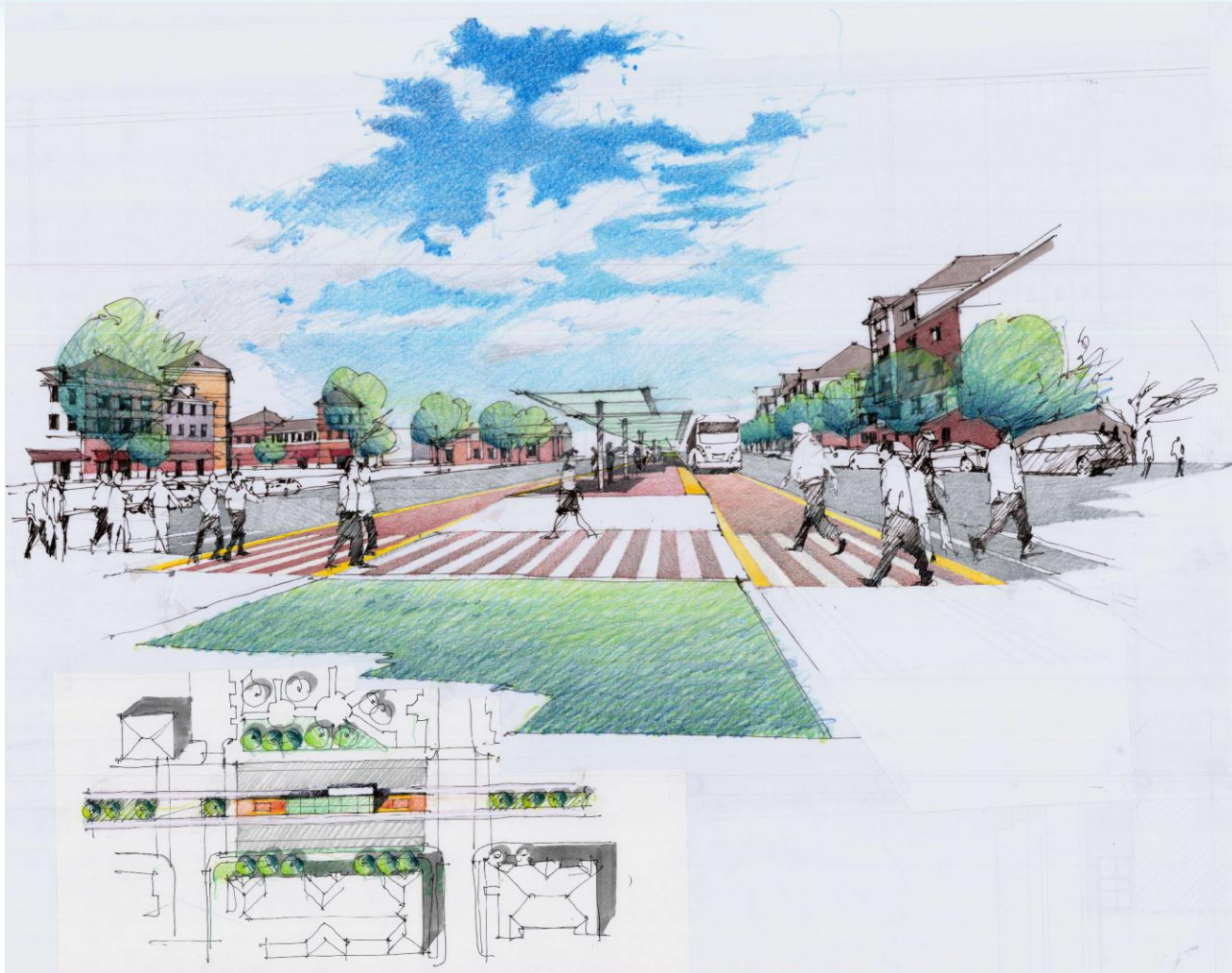
King Farm Station – Center Platform