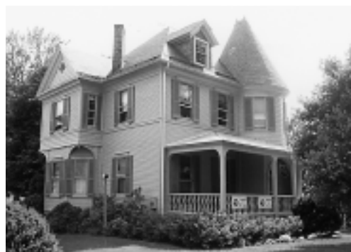
Edwin West House (1889)