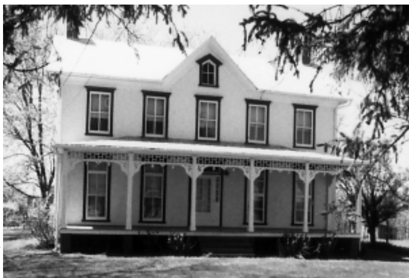
England-Crown Farm (c1880-1894) 20/17