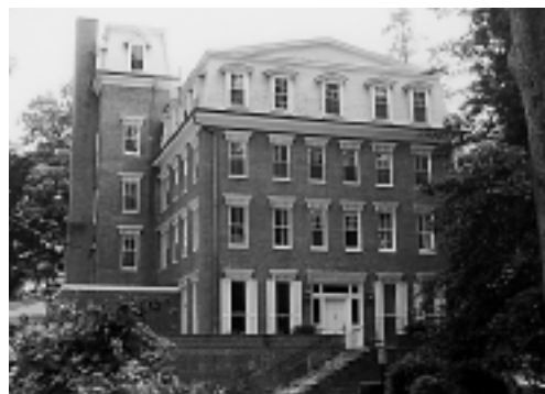
Woodlawn Hotel (1887-90)

Known as The Town Within a Forest, Washington Grove is a community with Carpenter Gothic cottages, mature oak trees, pedestrian walkways, public parks, forest preserve, and independent, community-oriented residents. Washington Grove began as a summer camp meeting ground established in 1873 by Methodist clergy of Washington, D.C. Founders selected a wooded site along the newly opened Metropolitan Branch of the B & O Railroad as a retreat from hot, malarial, urban summers. Sunday meetings drew as many as 10,000 worshippers.