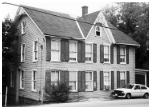
Pumphrey-Mateny House (c1883) 19/13-5