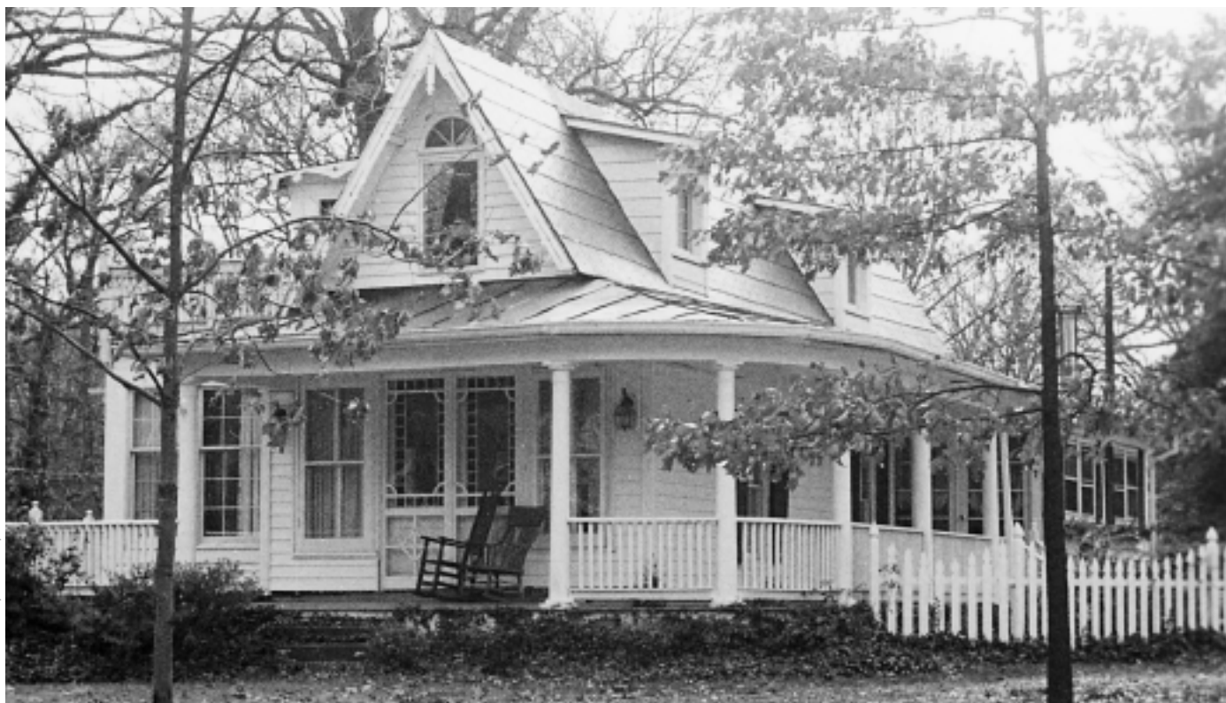
Clare Lise Cavicchi, MNCPPC, 2000

The campground was laid out with six walkway avenues radiating from a circle upon which founders built a wooden tabernacle. Campers erected 250 tents along the avenues in the first year, soon replaced by small wooden tents, and later by narrow Carpenter Gothic cottages. Though the tabernacle no longer stands, the Sacred Circle site has been preserved as a park. In contrast to the Tent Department, an area called the Cottage Department was platted between the circle and the railroad station. Lots and cottages in the Cottage Department were more spacious than in the Tent Department, reflecting the evolution of the community in its first decade from a two-week meeting to a season-long retreat, later year-round residence.