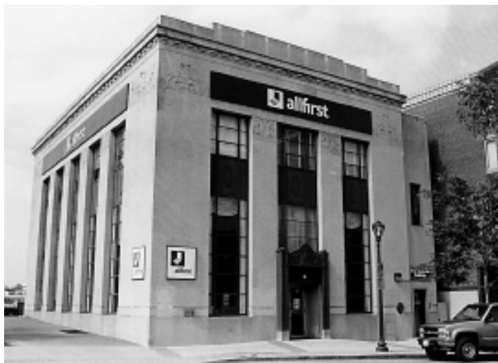
Farmers' Banking & Trust Company (1930-1)