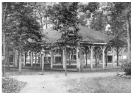
Ken McCathran collection