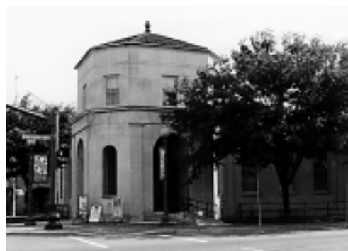
Rockville Post Office