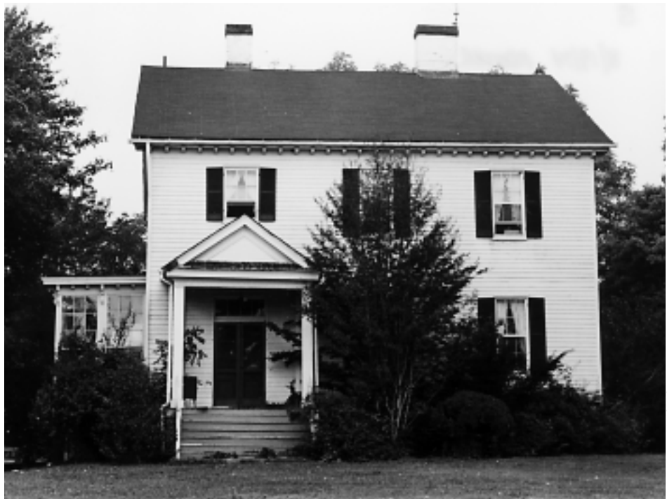
Oatland (c1875) 22/14