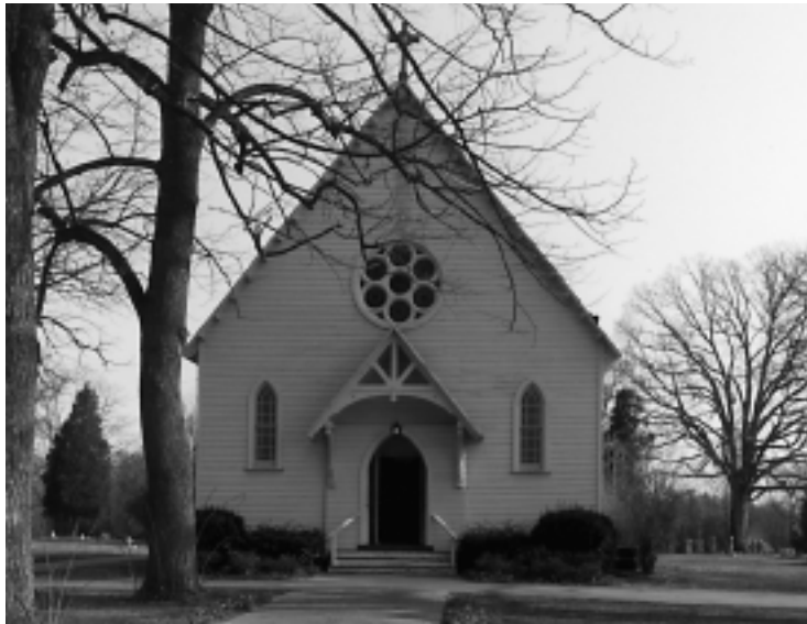
St. Rose of Lima Catholic Church 20/28 (1883)