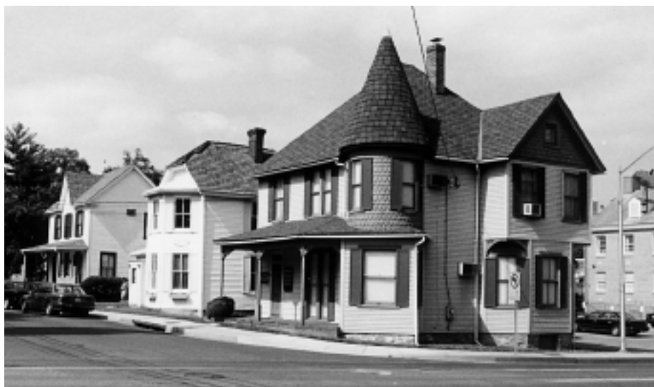
South Adams Street