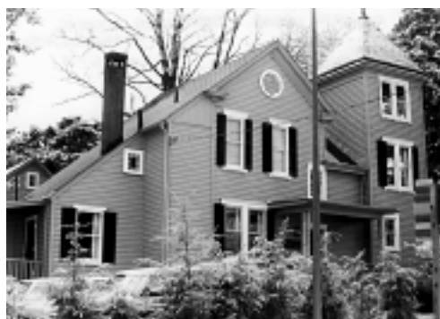
House at Washington & Jefferson Streets