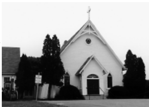
Neelsville Presbyterian Church (1877) 19/5