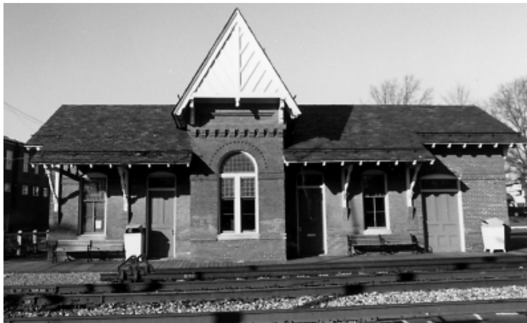
Gaithersburg B&O Railroad Station 21/2 (1884)

The Gaithersburg Station is a well-preserved example of a high-style, small-scale train station. Designed by Ephraim Francis Baldwin, architect for the B & O Railroad, the station was built in 1884, replacing an 1873 station. The picturesque brick structure (21' 7" by 56' 3") has a front-gable central tower, patterned brickwork walls, and gable-end wood stick-work. The east 12 feet (far right) were added 1905-7 to increase storage. In