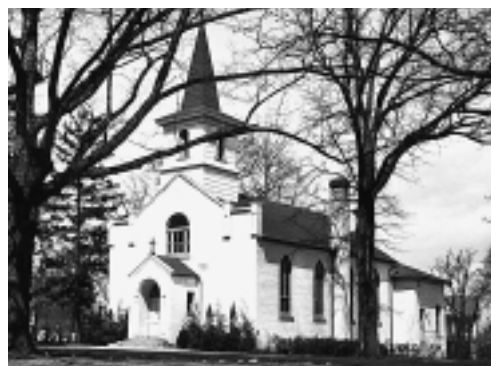
St. Mary's Church (1817)