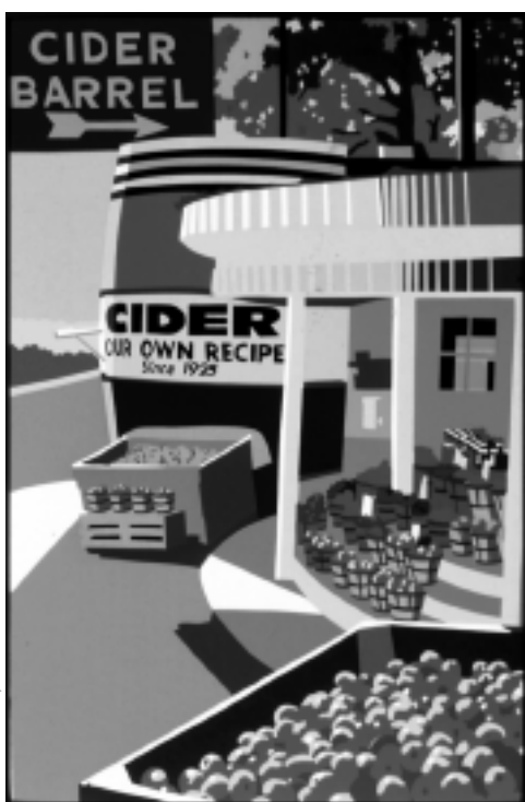
Kimberly Prothro, Traces for M-NCPPC, 1990

capping the head and base of the barrel lend a Streamline Moderne effect accentuated by an adjacent curved c1931 apple stand (right) hidden behind a sliding door. The Cider Barrel today remains a thriving business.