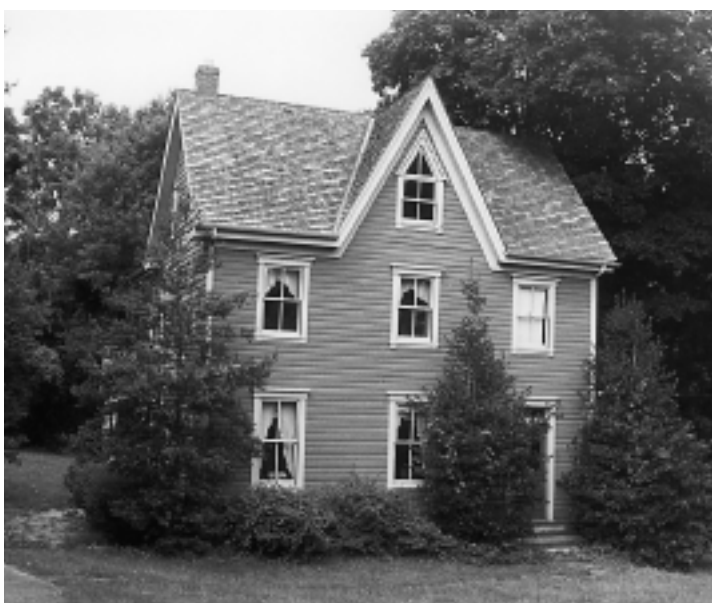
Clare Lise Cavicchi, M-NCPPC, 2001

Silver Spring station, no longer standing. Baldwin also designed the freight house (1887) adjacent to the Rockville station. The station and freight house, moved in 1980 for installation of Metro subway tracks, now accommodate offices.