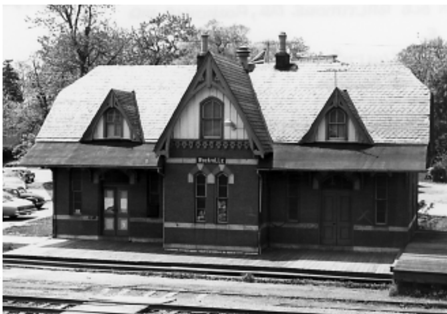
Michael Dwyer, M-NCPPC, 1975

The multi-gabled, polychrome structure is a fine example of a style known as High Victorian Gothic, typically reserved for public buildings in this era. Gray stone accents red brick, rust trim highlights fawn woodwork, red bands of roof shingles alternate with gray. Trefoil trim, open trusswork, pointed-arch windows, and tall chimney pots are characteristic features of the Gothic Revival. The station was a model for a