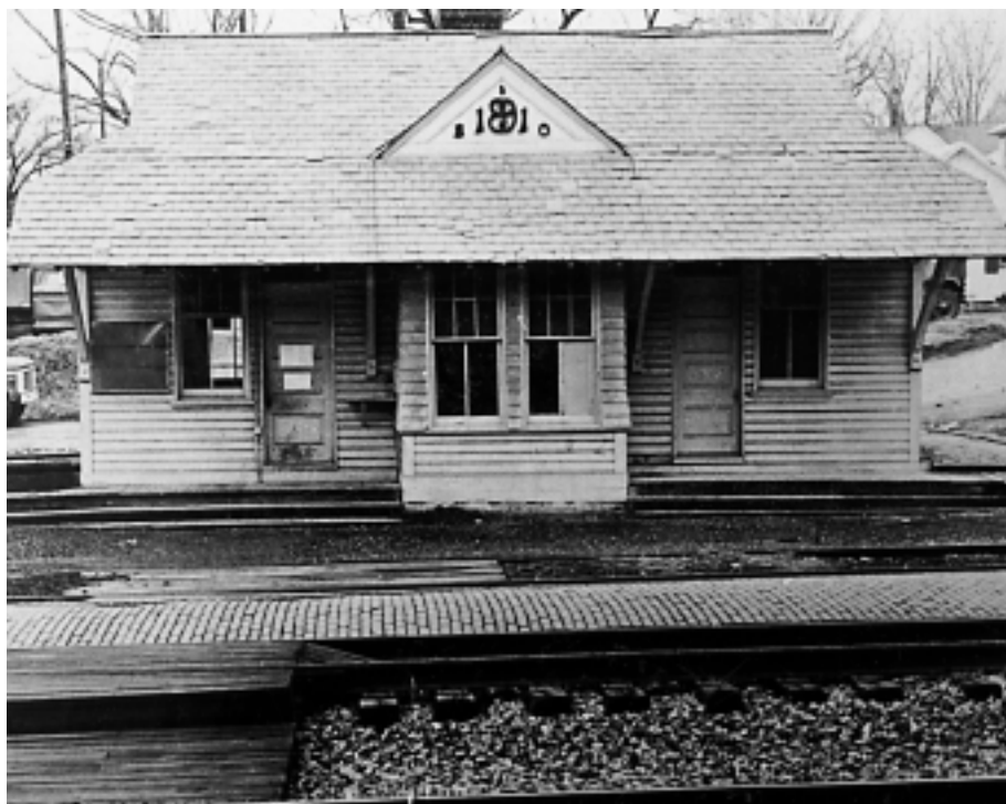
1969 view

The Germantown community became the center of commercial activity when the Bowman Brothers built a new steam-driven flour and corn mill next to the new railroad depot, making obsolete the earlier water-driven mills in the area. Bowman Brothers Mill was built in 1888 at the south side of Liberty Mill Road along the railroad tracks. The wooden flour mill burned in 1914, but was rebuilt and modernized in 1916 with six huge silos. In 1918 Augustus Selby and his 4 partners bought the mill, renamed it Liberty Mill, and operated it until 1963. A grain elevator and grain dryer were part of the operation in the 1920s and 30s, but burned in 1972 after the mill had closed. Still standing is a grain scale housed in a small metal shed on Mateny Hill Road, southwest of Blunt Avenue.