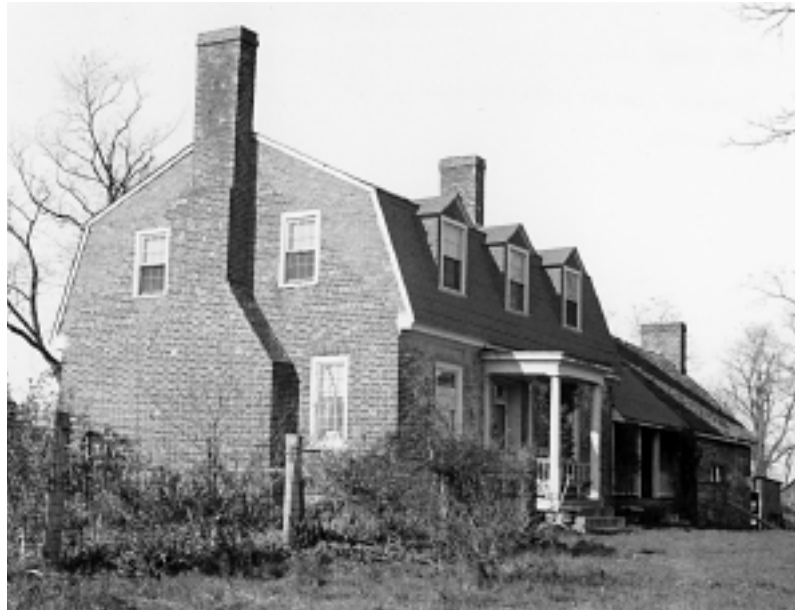
George Beall collection, 1930s; M-NCPPC

The Ridge is a modest mid-18th century dwelling with sophisticated architectural detail. The mid-18th century brick dwelling is connected by a hyphen to a stone wing, believed to predate the brick section. The 36' x 30' brick section, constructed c1750, features a brick base with a top course of molded, double curve bricks. Interior features typical of the mid-1700s include corner fireplaces, wood paneling, and a built-in closet with fluted pilasters. The stone section may have been used as a dwelling until the brick section was constructed, after which it became the kitchen with slave quarters above. A covered walkway connecting the two structures was fully enclosed in the Civil War era. Owner Zadock Magruder was a Revolutionary War leader and was instrumental in the founding of Montgomery County. In addition to serving as colonel in the militia, Magruder contributed money for arms and ammunition, and donated wool from sheep raised at The Ridge, for soldiers fighting in Valley Forge with George Washington. The original gable roof of the brick house was converted to a gambrel in 1925. Behind the main house is a log building constructed before 1860 and used at one time for a smokehouse. These two structures and the 6.83 acres on which they stand represent a 1,000 acre plantation established in the early 1700s, and owned for some 220 years by the Magruder family and its descendants.