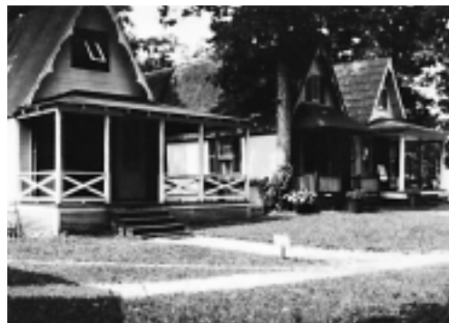
The Sacred Circle and cottages, Historic view