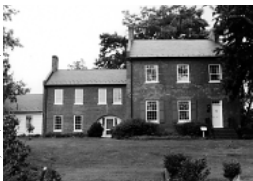
Kimberly Frohno, Traces for MNCPPC, 1990

store and warehouse were destroyed by fire in 1895, a new fire-resistant building was built near the station. The Wire Hardware Store (1895) is the area's last surviving cast-iron front commercial structure. The Late-Italianate style store has brick corbelling and massive shouldered window lintels. The Rockville Railroad Station , moved to its present site in 1980, is listed separately in the National Register (p. 197).