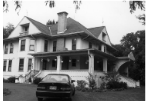
Henry and Fannie Dawson House 26/19 (1913)