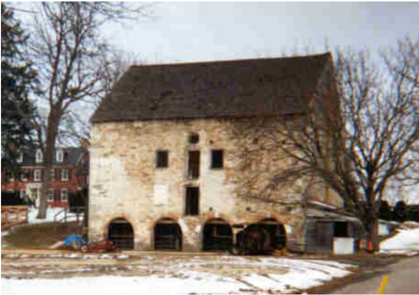
Woodlawn Barn, potential site for gateway and interpretive center for the Underground Railroad/Quaker Heritage Cluster

On January 24, 2003 the Maryland Heritage Area Authority approved the Management Plan for the Montgomery County Heritage Area, and Montgomery County became the State's 8th Certified Heritage Area.