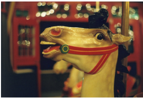
A Glen Echo carousel horse.