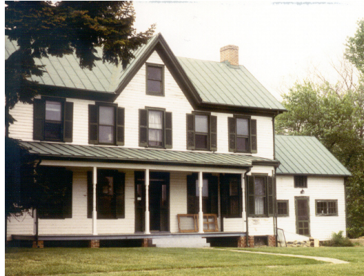
Bussard Farmhouse in Derwood exemplifies use of “green” rehabilitation techniques.

We have learned some surprising things about sustainability in our study of older buildings. We have learned that properly repaired and maintained historic wood-frame windows do not have to be