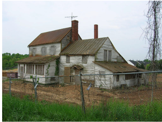
Higgins Tavern before restoration (left) and after.