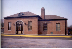
Historic Silver Spring Train Station