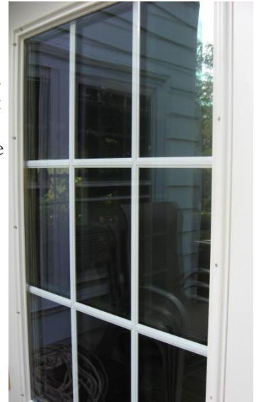
Vinyl simulated divided lights.

The historic preservation community continues to study issues surrounding the appropriate use of replacement materials. The HPC regularly assesses its approach based on nationally accepted best practices, local considerations and new and evolving understanding of these products. Staff and Commissioners recently attended an informative workshop hosted by the Maryland Association of Historic District Commissions entitled "Substitute Materials and Replacements: Why We Say No, When to Say Yes," which presented information about appropriate and inappropriate substitute materials for roofs, siding, windows, porches, and landscape features of historic sites. Preservation staff is always available to discuss project proposals, including the appropriate treatment of historic materials, with applicants. The HPC will soon be adopting design guidelines which will explain the principles of preservation and give general guidance to homeowners who may be considering alterations to their house or property. The design guidelines will discuss appropriate and inappropriate substitute materials. These design guidelines will be posted on the Historic Preservation web site, www.mc-mncppc.org/historic/ , and will be announced in a future issue of this newsletter.