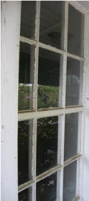
Wooden true divided lights.