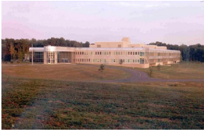
COMSAT Laboratories Building in Clarksburg.