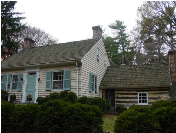
M-NCPPC-owned cultural resources include the Riley House, recognized by historians as the real "Uncle Tom's Cabin."