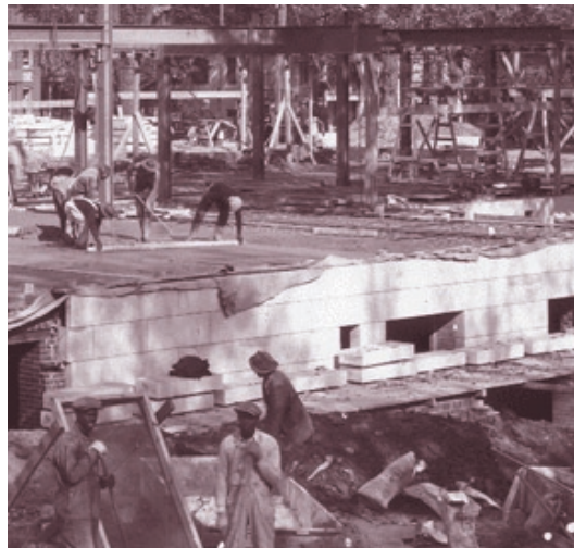
Construction of the 1931 Courthouse provided work for skilled and unskilled African American laborers. Visit it on the Walking Tour of Rockville's African American Heritage.

Some of these walking tours were completed with help from a Historic Preservation Commission grant (see the column at right for details about the upcoming grant application process). Brochures are available in one stop by visiting the Montgomery County Conference and Visitors Bureau at 12900 Middlebrook Road, Germantown. Call them at 301-428-9702.