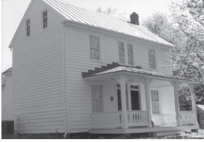
Bennett-Allnut House in Spencerville.