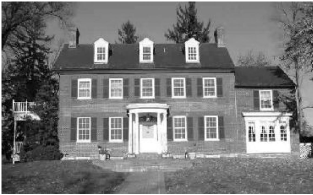
Woodlawn Manor, where Montgomery County Heritage Days celebration includes a three-course English tea on Sunday June 26.