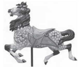
A book by the Glen Echo Park Partnership for Arts and Culture will feature a history of carousels.