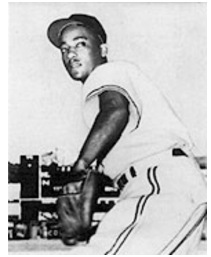
Sandy Spring Museum will produce a video on the history of the Negro Baseball Leagues in Montgomery County.

The HPC will help with the printing of the brochure for the annual Montgomery County History Tour Weekend.