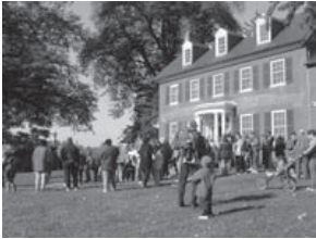
Emancipation Day hikers gather at Woodlawn Manor.