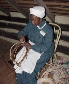
Celebration of Emancipation Day included a basket weaving demonstration at Oakley Cabin in Brookeville.